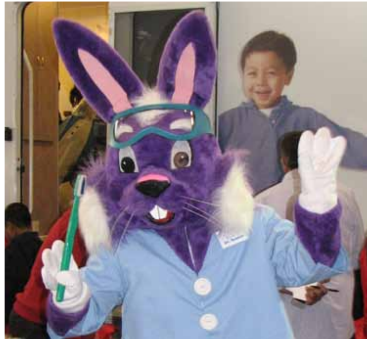
• Dr. Rabbit has a message for kids at the 2011 Greater New York Dental Meeting — Brush! He will be back again this year to educate even more children.

A child-friendly nutrition center is packed with plastic fruits and vegetables to teach the children how to build a well-balanced plate with all the healthy food groups while puppets