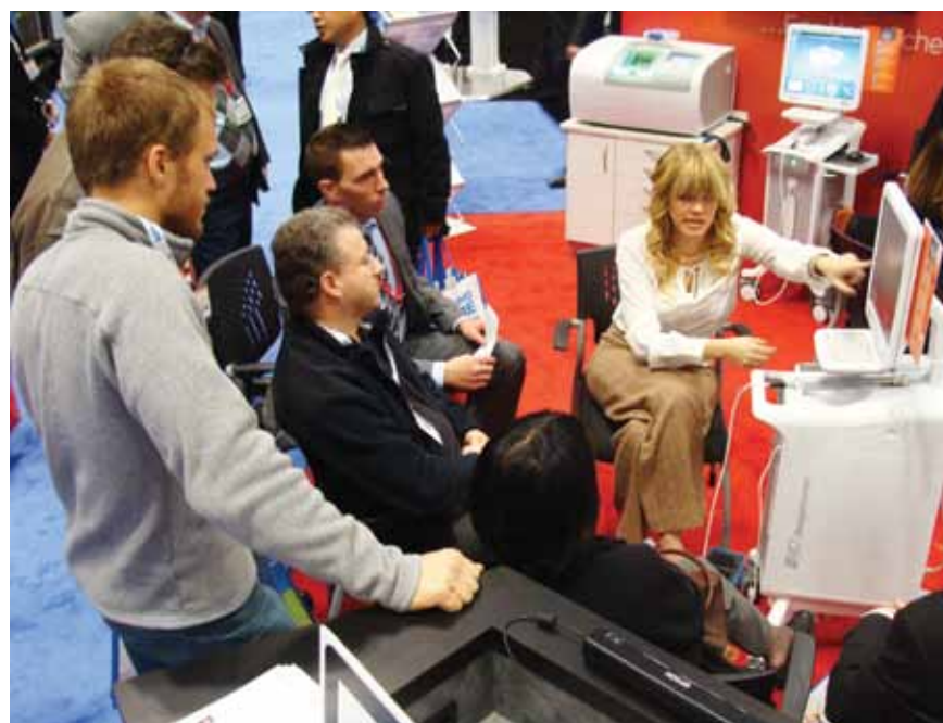
• Meeting attendees learn more about D4D technology at the Henry Schein booth (No. 3824).