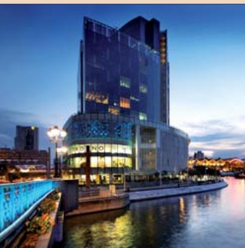
AmannGirrbach's new office as seen from the Coleman Bridge in central Singapore.

The new Singapore branch will support Amann's distribution partners in both regions through logistics and responsive customer service, the company said. It also announced plans for a help desk and company training centre to be established by the end of the year.