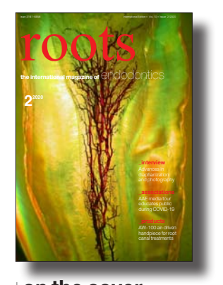
on the cover A diaphanized maxillary molar with exposed vascular distribution.