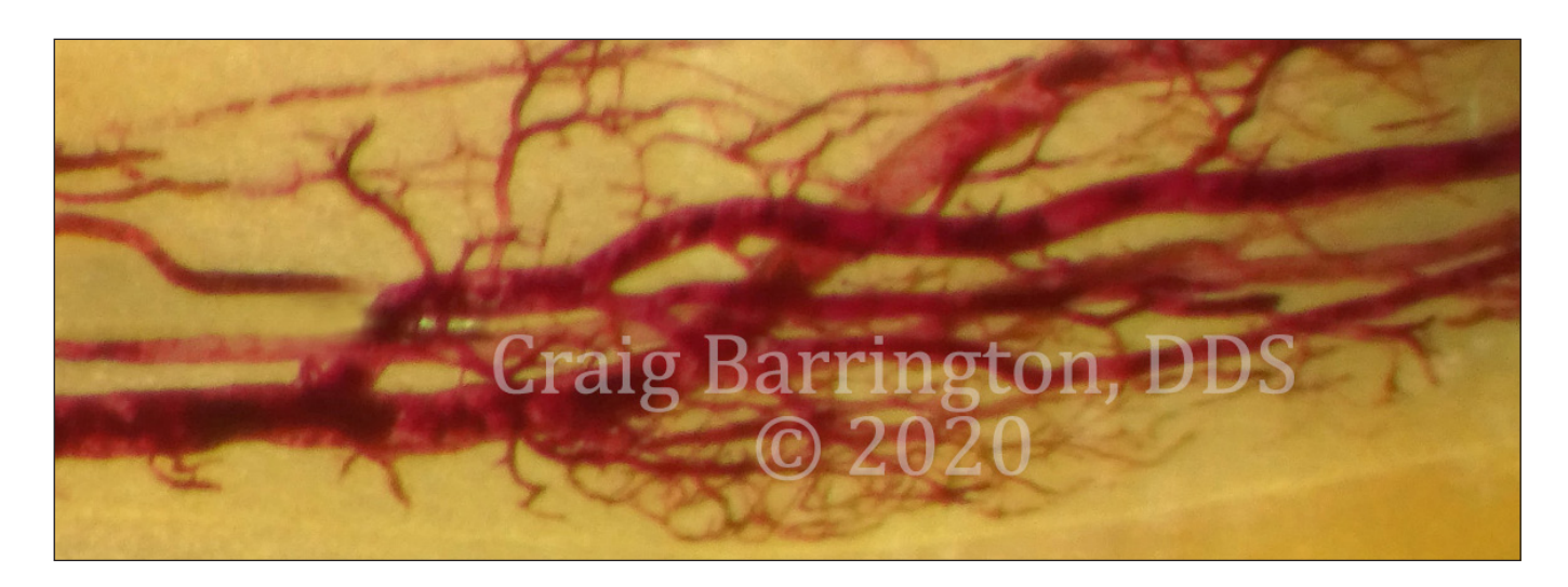
Fig. 3_The vessel distribution within the canals of teeth is a gravity defying, law of physics breaking, anti-law of conservation of matter and mysterious observation that needs much more documentation.