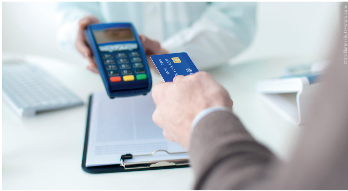
The BDA said that the latest hikes have reached levels that now exceed the price dentists are paid to provide services.

LONDON, UK: The government is expected to gain tens of millions of pounds from dental practices owing to recent increases in charges, the British Dental Association (BDA) has said. According to a recent analysis by the organisation, the Ministry of Health are to collect an estimated £40 million in profits by the time of the next general election in 2022 from NHS-funded treatment.