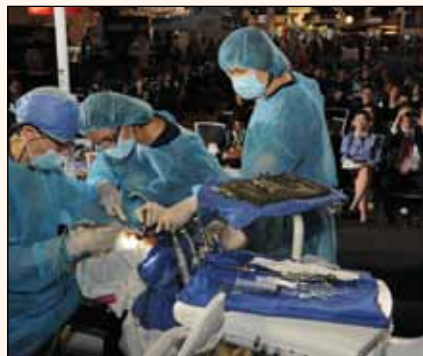
Always a PDC highlight: Live dentistry in the exhibit hall.

Possible to earn up to 20 C.E. credits at the annual Pacific Dental Conference