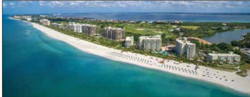
The Resort at Longboat Key Club in Longboat Key, Fla., is the host site of the 2018 Smiles in the Sun Seminar for dental professionals.

Sarasota, Tampa or Southwest Florida International airports.