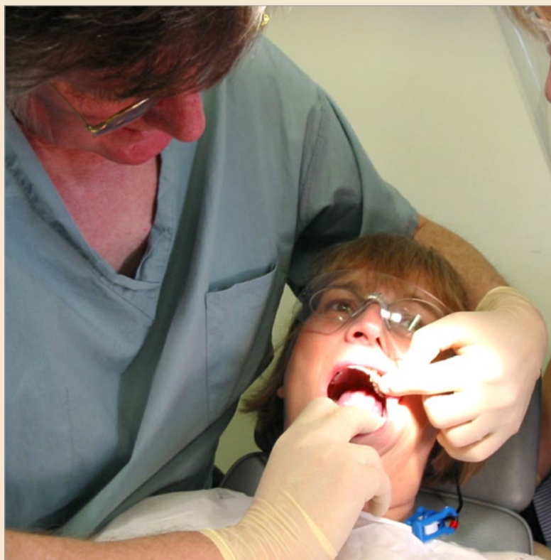
The new findings could be a great help for those suffering with dry mouth

According to a recent report, researchers from the University of Louisville are closer to helping millions of people who suffer from dry mouth.