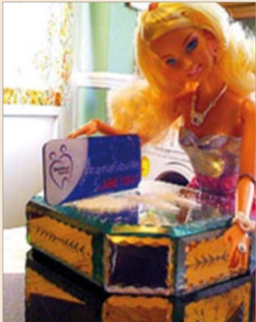
One of the competition ideas

Dentists across the country were called to use their creativity in a competition designed to show off the power of social media.