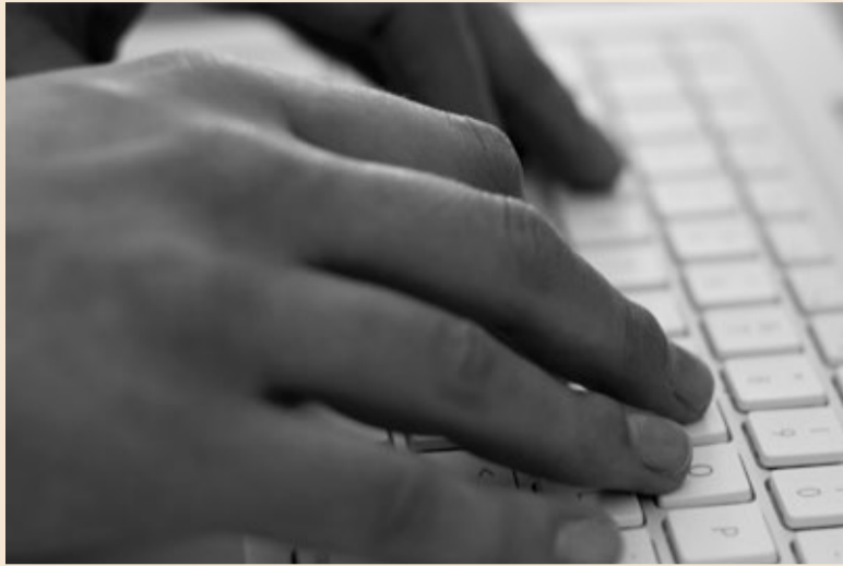
GPs are seeing a rising use of wikipedia for professional information gathering

A new report has revealed that 60 per cent of European doctors are using Wikipedia for their work. 300 GPs across Europe were interviewed for the report, which examined how regularly doctors accessed the internet