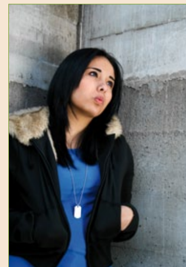
Dental hospitals are more attractive than NHS dentists

According to the report, there are still NHS spaces across the city and even though appointments cannot be made to visit the A&E dental department, it is possible to join a queue to access care. DN