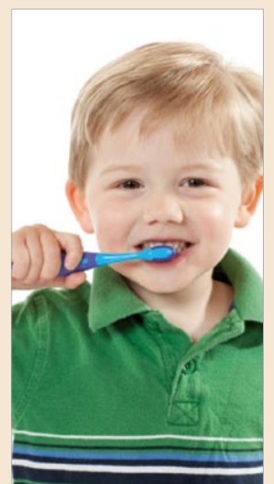
Thinking of the children