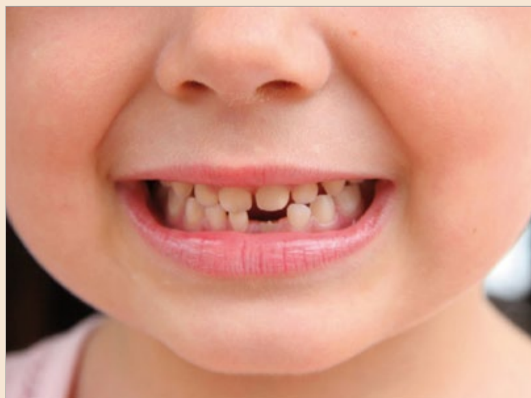
A third of children under five in Birmingham have tooth decay or missing teeth

early age and parents need to take responsibility for their children's oral health. DN