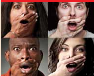
Move over Movember This month is Mouth Cancer Action Month