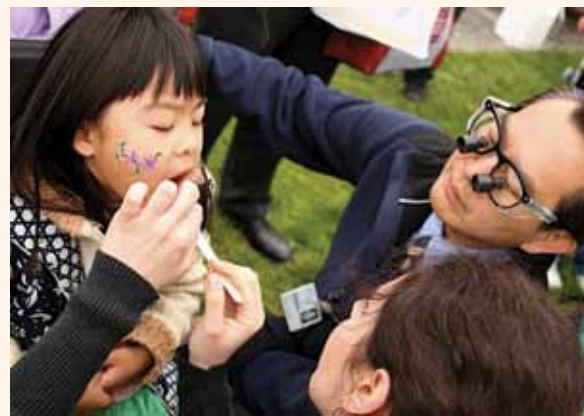
Children receive dental screenings at the University of California at San Francisco during a recent outreach event conducted by the National Children’s Oral Health Foundation.

The facilities are members of the NCOHF’s national affiliate network and are dedicated to delivering comprehensive oral health treatment and preventive educational programs to millions of underserved children and their families.