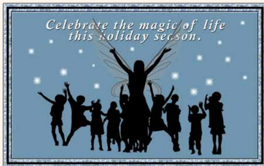
This holiday card is one of several designs available from America's Tooth Fairy.

He has also been a Kiwanis Club member for 33 years (with a perfect attendance record); on the Teen Challenge of Kern County Advisory Board for 23 years; and has been on the board for 20 years of STEPS (Special Treatment Education and Prevention Services), a local drug and alcohol treatment and rehabilitation organization, serving two years as president. DT