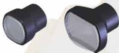
NEW Micro2.5x Scopes™