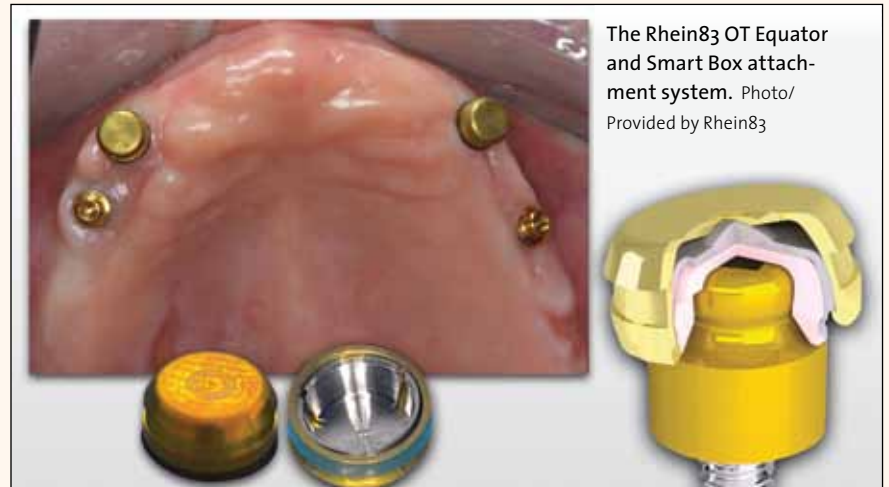
The Rhein83 OT Equator and Smart Box attachment system.