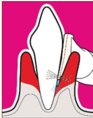
Fig. 1: Perio-Flow hand-piece and nozzle for subgingival use.

"Air-Flow goes subgingival," says EMS, and brings the point home. A unique nozzle delivers the air-powder mixture deep into the pocket