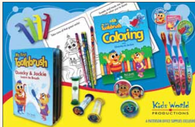
Dental practices can use the dental health tools shown here to develop rapport with young patients.

"It is well-documented that primary tooth decay increases the occurrence of decay in the secondary teeth," he said. "Prevention is the best way to stop tooth decay." ■