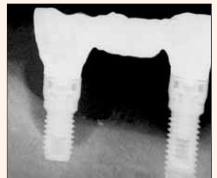
Fig. 3: Implants are a poor investment without regular periodontal disease management.

pockets (up to 10 mm). According to EMS, it creates optimum but gentle turbulence in subgingival areas and prevents soft-tissue emphysema via three horizontal nozzle outlets for air-powder mixture and one vertical nozzle outlet for water.