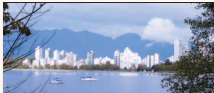
Vancouver, B. C., is host site of the annual Pacific Dental Conference.

The PDC Lab Expo, with a new look and direction, will be Saturday, March 11, bringing together dental techs, denturists, dentists and staffs. Expo attendees will be