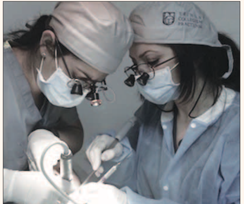
'Q-Implant Marathon' course participants.

• "Prior to coming to this course, I had only theoretical/didactic knowledge in implantology. You gain immense knowledge in placement, treatment planning and surgical skills. As a beginner, I would highly recommend tak-