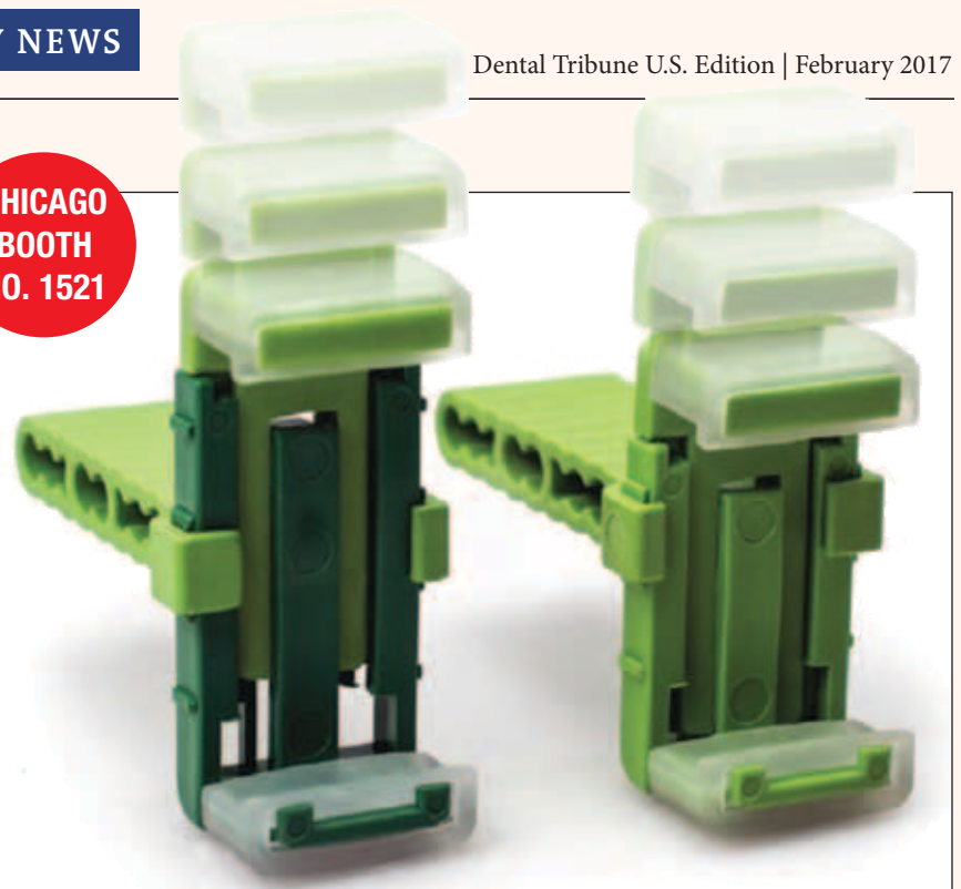
The Sensibles universal sensor positioner (large and medium sizes pictured,) now feature unique locking bumpers that enable you to slide the bite block to any of several fixed positions.