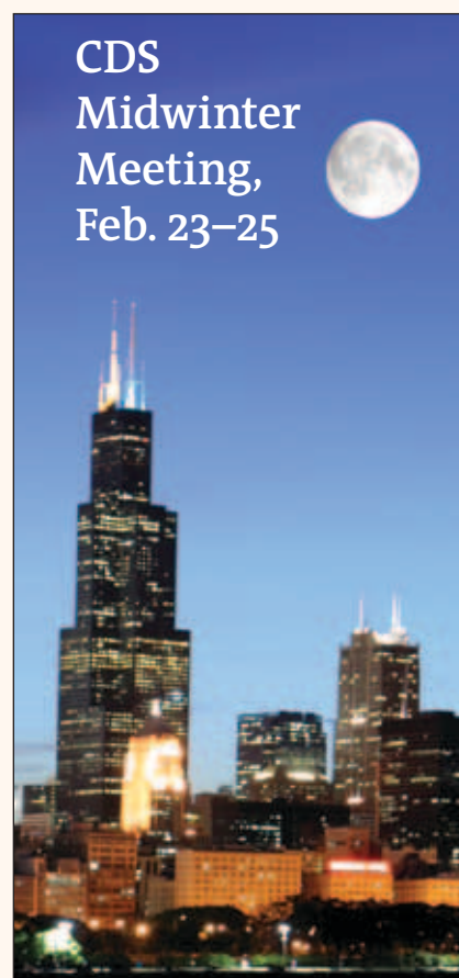
The Chicago Dental Society Midwinter Meeting, among the nation's largest and longest-running dental events, is held near downtown Chicago at McCormick Place West. The 2017 meeting anticipates featuring more than 140 speakers, 225 courses and 700 exhibiting companies.