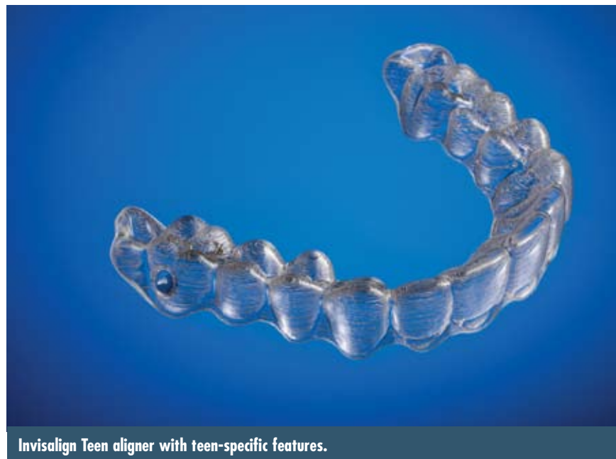
Invisalign Teen aligner with teen-specific features.