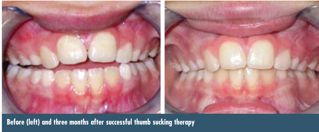
Before (left) and three months after successful thumb sucking therapy

learning and behavior problems in school.