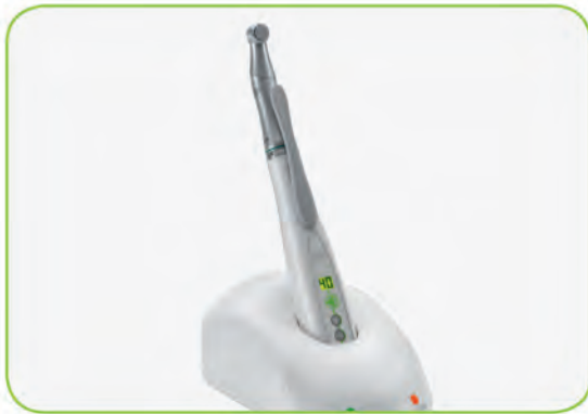
IA-400 Digital torque wrench