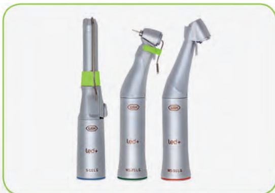
Surgical straight and contra-angle handpieces with or without Mini LED+