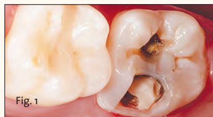
Fig. 1: Broken molar (#18 O/B surfaces).

In summary, even though vulnerable adults continue to face challenges, more older people than ever before are keeping a greater number of their natural teeth for life as a result of decades of effective prevention and education. Bulk-fill composite is an invaluable “direct, one-appointment” option for posterior restorations because it offers a high depth of cure for quick and confident placement, but doesn’t sacrifice any of the other im-