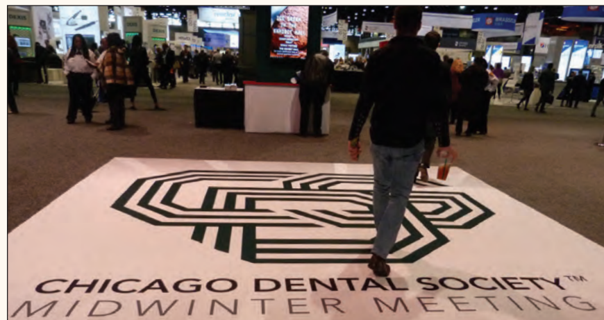
The Chicago Dental Society's Midwinter Meeting includes a three-day exhibit hall that runs from Thursday through Saturday, Feb. 21–23. The hall features more than 600 exhibiting companies and organizations and numerous C.E. opportunities.

hall, the Midwinter Meeting also delivers abundant opportunities to network with colleagues and other professionals throughout the dental community. Catch up with classmates at various Midwinter Meeting special events, gatherings and associated events, including the mentor luncheon, new-dentists reception and various dental school alumni reunions.