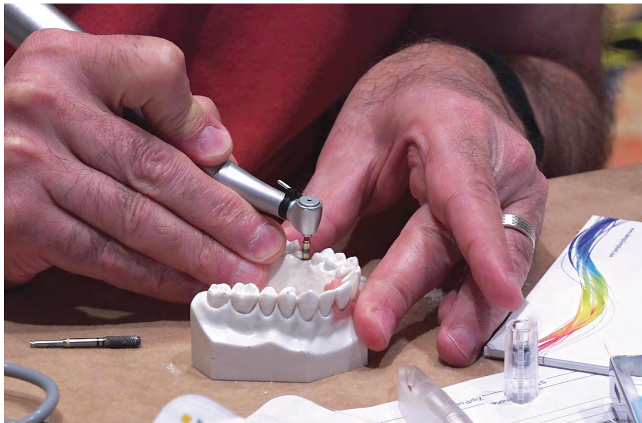
Hands-on workshops and pre-conference sessions have been announced for March 13 as a kick-off to the AO 2019 Annual Meeting, which takes place March 13-16 in Washington, D.C.