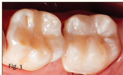
Fig. 3: Occlusal adjustment and polish.