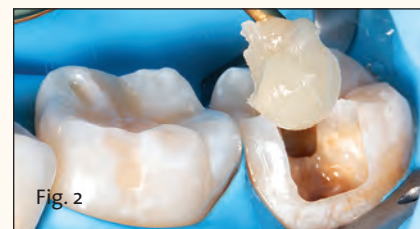
Fig. 2: After a rubber dam is placed and all decay is excavated, REVEAL HD Bulk is placed in two large increments and light cured.