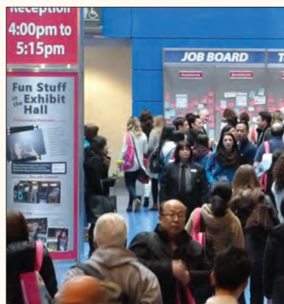
Attendees enter the exhibit hall on opening morning at the 2018 PDC.

PDC After Hours takes place Friday evening and late into the night at Vancouver's legendary Commodore Ballroom, featuring the Famous Players Band, widely recognized as Vancouver's best live band because of the way they change the way people experience live music. The $25 (plus GST) cost includes two drinks, dinner and the live dance band. Guests must be at least 19 and have valid ID.