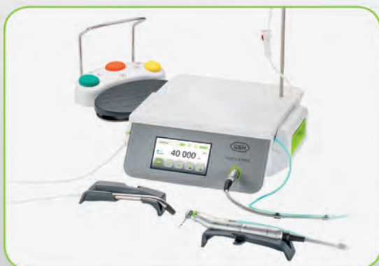
Implantmed SI-1015 with wireless foot pedal option, Osstell ISQ option and LED powered motor option