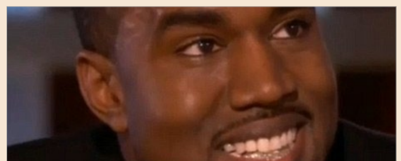
Georgia Jagger and Kanye West are not going for the perfect smile