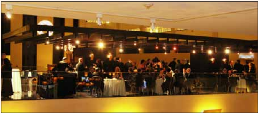
The Greater New York Dental Meeting's annual Dinner Dance took place Saturday evening, Nov. 27, at the New York Marriot Marquis Hotel. The black-tie event featured cocktails, dinner and dancing with music provided by The Ultimate Entertainment.