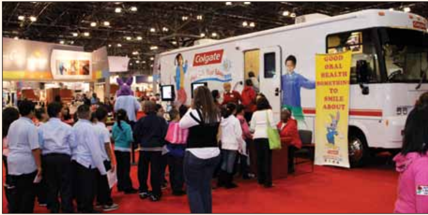
New York public school children enjoy the Greater New York Smiles Children's Program on Monday, Nov. 29, which aimed to instruct and demonstrate the importance of oral health care to local youth.