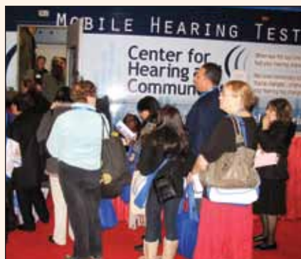
Attendees at the Center for Hearing Communication mobile unit wait for a turn to test their hearing.