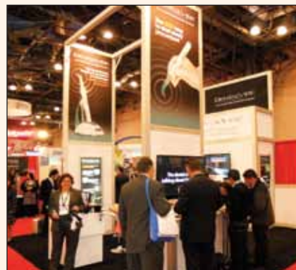
(at left) Attendees are flocking to the DentalVibe booth for good reason. The system, which allows for comfortable and predictable injections, was available at a discount during the GNYDM.