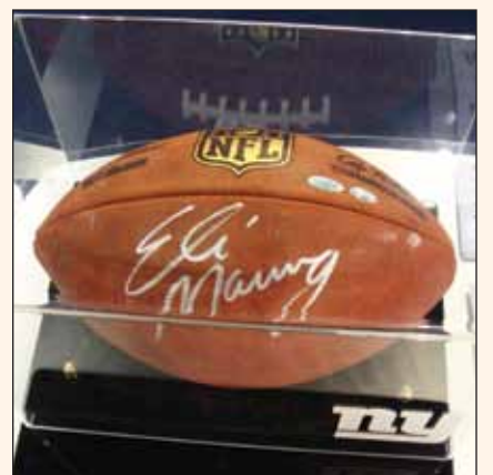
A football signed by Eli Manning at the Aseptico booth.