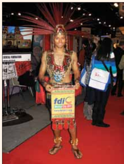
A vibrant visual reminder for the 2011 FDI meeting, which will take place in Mexico.