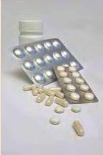
Aspirin use could prevent cancer by a quarter

Taking a regular low dose of aspirin could prevent head and neck cancers by almost a quarter, according to new research. The results of the study, published in the British Journal of Cancer, concluded that people were almost a quarter (22 per cent) more likely to avoid developing head and neck cancers if they took aspirin on a weekly and monthly basis. Throat cancers had the most benefit from regular aspirin use.