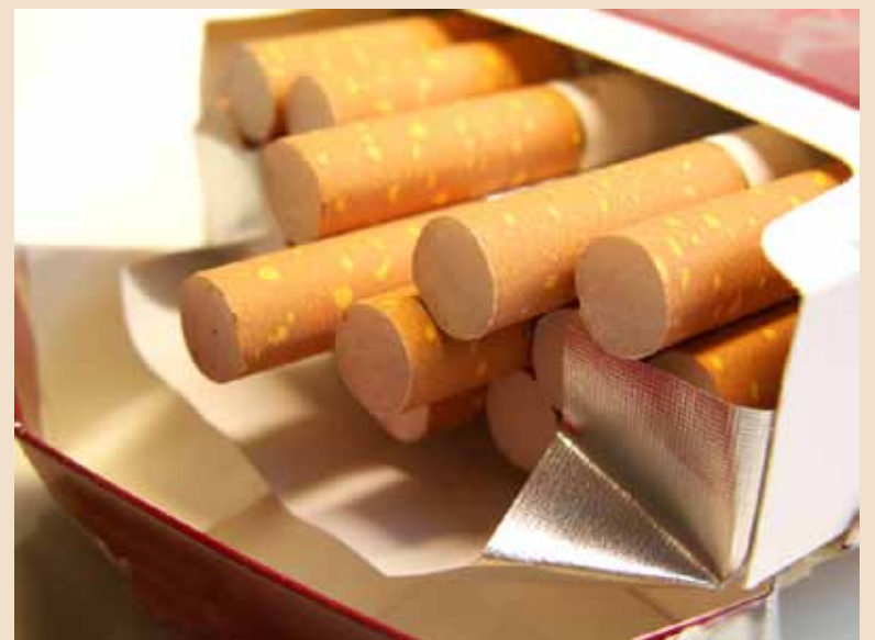
Young smokers say display ban helped them quit

"The key to preventing a future generation of smokers is to try and discourage people from starting in the first place, as the older people get, often the harder it can be to quit." DT