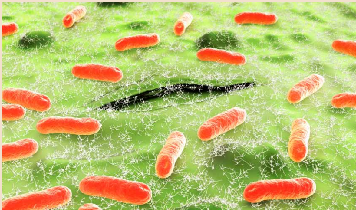
40 per cent of bib clips tested reported aerobic bacteria

Researchers at Tufts University School of Dental Medicine and the Forsyth Institute have published a study that found that a significant proportion of dental bib clips harboured bacteria from the patient, dental clinician and the environment even af-