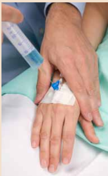
Sharps injuries are a daily risk to health workers

A new study published in the scientific journal Occupational Medicine has found that those who experience needlestick injuries can suffer persistent and substantial psychiatric illness or depression.