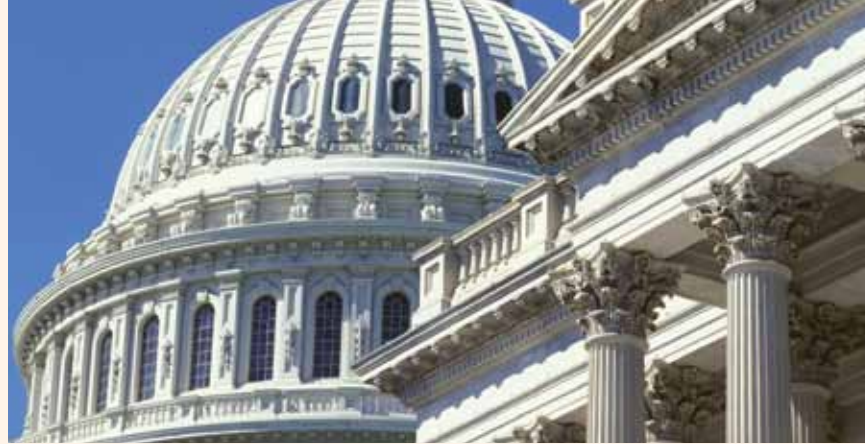
Financial services reform legislation being debated in Washington could hurt dental practices, according to the ADA and other dental associations.

As currently written, the Restoring American Financial Stability Act of 2010 would subject health care providers who regularly charge interest on outstanding bills or allow patients to pay in installments to federal scrutiny.