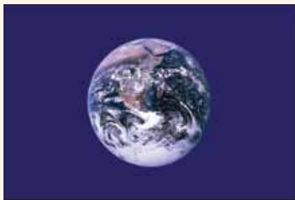
The unofficial Earth Day flag, designed by John McConnell.