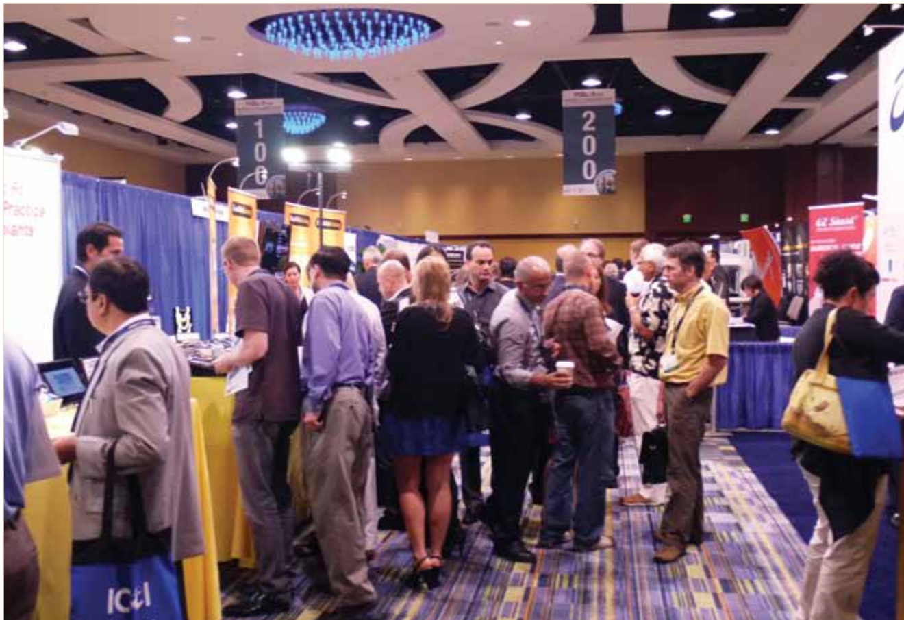
Participants flow through the exhibit hall at the ICOI World Congress in Florida this September.

ICOI celebrates milestone with a look at implant dentistry's innovations, complications and controversies