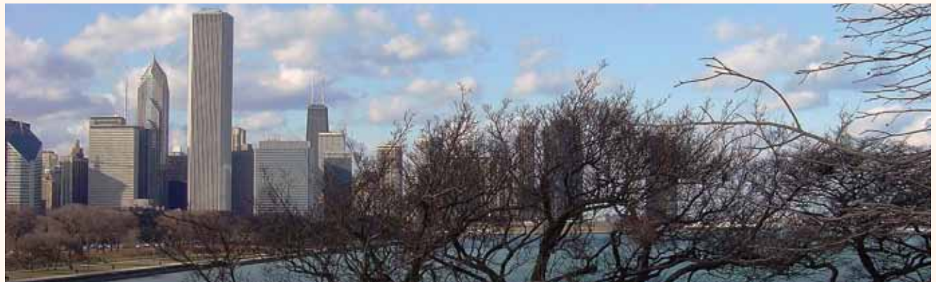
In addition to gaining access to hands-on courses and CE credit opportunities, attendees at the 2012 Chicago Dental Society's Midwinter Meeting get to explore one of the country's biggest and most fascinating cities.

New this year will be live treatment cases, broadcast on the exhibit floor each day of the meeting. Visitors to the meeting will be able to watch clinicians treat patients in a theater constructed on