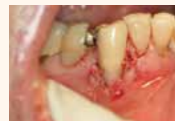
Fig. 5 Periodontal flap is closed with Ethicon #5 non-resorbable sutures.