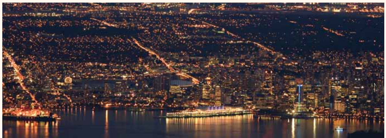
The Pacific Dental Conference combines all the excitement of Vancouver, named the world's 'Most Livable City' in 2011 by the Economist Intelligence Unit, with compelling educational opportunities for the entire dental team.

The Live Dentistry Stage is back on the exhibit hall floor, with demonstrations