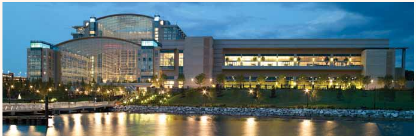
The Gaylord National Resort & Conference Center in National Harbor, Md., with its 18-story-tall climate-controlled atrium of glass and steel, is host site of the American Academy of Cosmetic Dentistry 28th Annual Scientific Session.

(Source: American Academy of Cosmetic Dentistry)