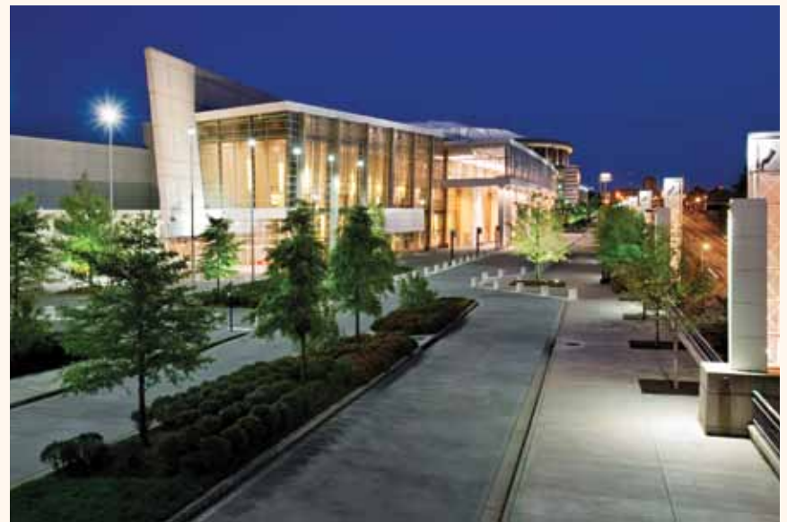
At least 23,000 dental professionals are expected at the 100th Hinman Dental Meeting, at the Georgia World Congress Center in Atlanta, pictured.

Hinman's 2012 Continuing Education program includes a new three-day educational track, "Emerging Dentist's Sur-