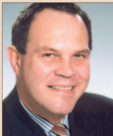
'Dentists are not targeting contracts for easy money'

The British Dental Health Foundation has called on politicians to stop playing politics with people's oral health, after the Tories made claims that dentists were overcharging patients, so they could make more money from their NHS contracts.