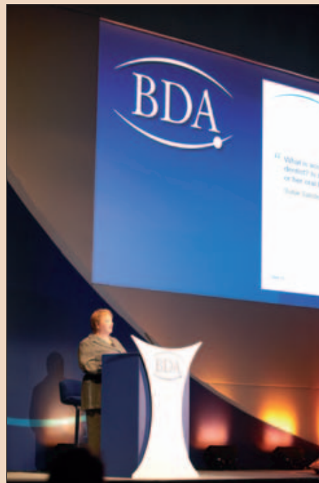
'This announcement is long overdue'

The review was set up following a damning report by the Health Select Committee which criticised the new dental contract.