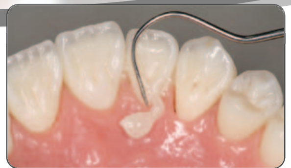
Gel-phase for easy clean-up of excess material