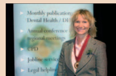
BSDHT new president