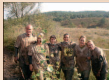
The courses will be held in Stratford-upon-Avon

The courses are a great opportunity for all members of the dental team to hear leading ex-