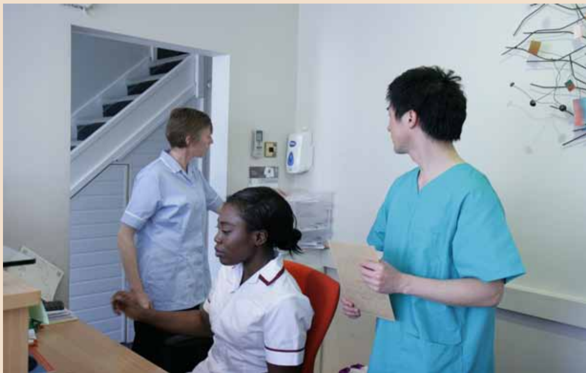
Practices are still awaiting the framework necessary for the commissions of services

A report from the recent Dental Law and Ethics Forum meeting