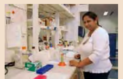
Bitter melon could treat head and neck cancer

Bitter melon, a vegetable that is a staple of diets in India and China, is also a folk remedy in those countries for treating diabetes. Metformin, a drug developed to treat diabetes, is used for cancer therapy. Ray hypothesised that a folk medicine for diabetes also might work to treat cancer. DT