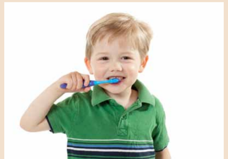
More than 41 per cent of Welsh children experience dental decay

aspirations of the Oral Health Plan." DT