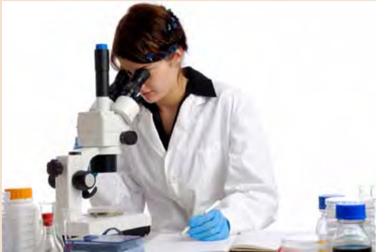
Genetic code discovery could help treat perio

Scientists at the Oak Ridge National Laboratory (ORNL) have found the genetic code of bacteria, which could lead to treat-