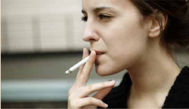
Almost 600 children a day take up smoking

Around 207,000 children aged 11-15 start smoking in the UK every year according to new research published by Cancer Research UK.