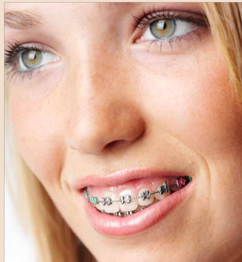
Clinical evaluations of fixed appliances