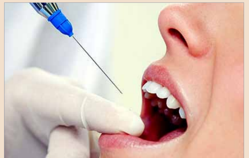
Mannitol to help anaesthetic success?

all teeth, offering a greater level of pain relief for dental patients. DT