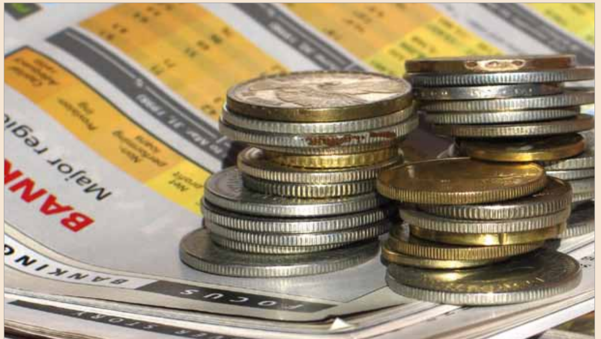
£1.7m in funding has been invested in the research project, aimed at investigating the cost-effectiveness of prevention programmes

Prof Porter said: "The sampling method is non-invasive and merely requires brushing the surface of the lesion; if the accuracy of dielectrophoresis is proven to deliver an accurate diagnosis, then the screening of large at risk populations will become both practical and cost effective, potentially saving many lives." DT