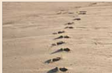
Walk the walk - spend time with the peer group you want to be in

7 Focus on solutions, not problems - you have to switch your focus to solving the issues preventing you from get-