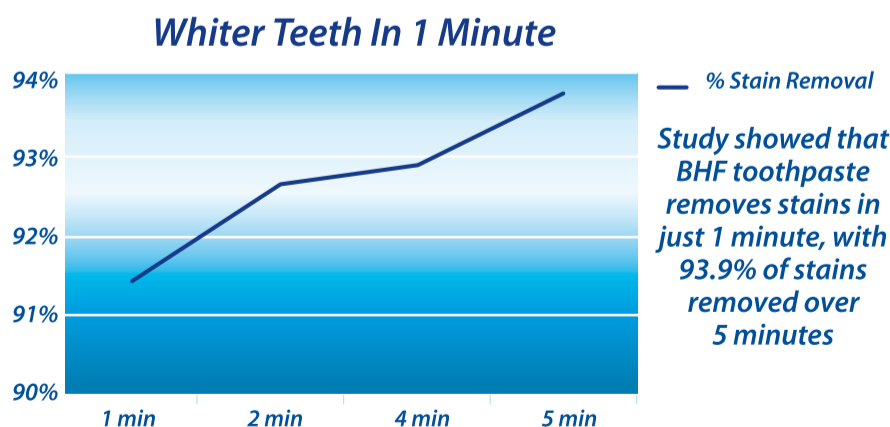
Results from stain removal study conducted at Bristol University on Beverly Hills Formula toothpaste over a 5 minute treatment period