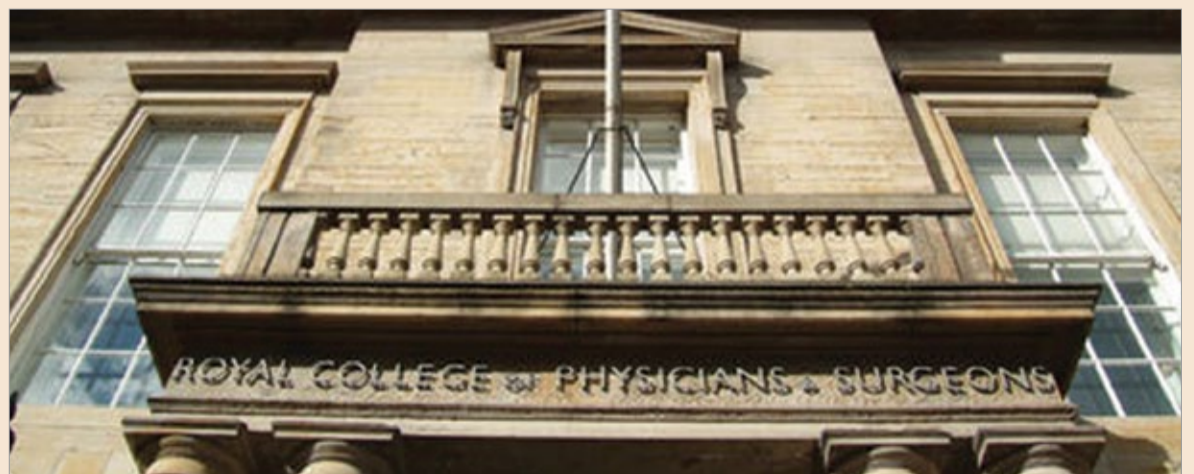
The Royal College of Physicians and Surgeons of Glasgow