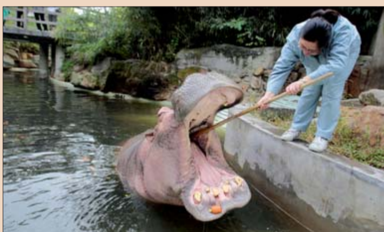
A keeper at the Shanghai Zoo in China using a broom to brush the teeth of a hippo. Unlike humans, these animals have 40 teeth and can open their mouth to an angle of 180 degrees.

India currently has only eight forensic dentistry experts nationwide, of which most have received their formal education abroad. DTI