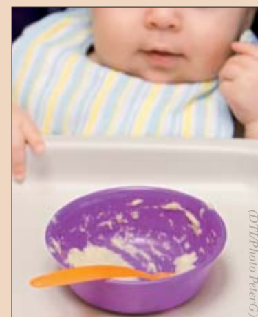
(DTI/Photo Peter G)

According to the US Centers for Disease Control and Prevention, one-third of children between the ages of 12 to 15 years in the US suffer from some form of fluorosis. The country also has the highest occurrence of flouridated water in the world. DTI