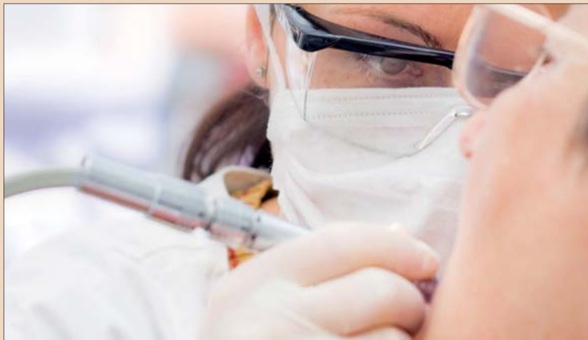
More and more dentists in Australia eye for foreign made dental work.

Job prospects for dental technicians have been steady recently but could decline by 50 per cent over the next 10 years, a government report has found.