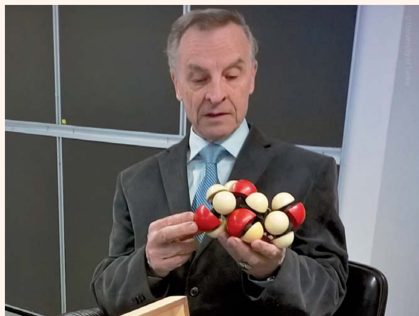
Professor Emeritus Kauko K. Mäkinen posing with a model of the xylitol molecule.

Regular consumers who use xylitol for dental purposes have no side effects. If somebody accidentally consumes larger single doses, for example, 20–30 grams, some individuals may have transient diarrhoea. However, sorbitol, mannitol and common milk causes much more severe symptoms. Of course, small children must use xylitol gum under parental guidance.