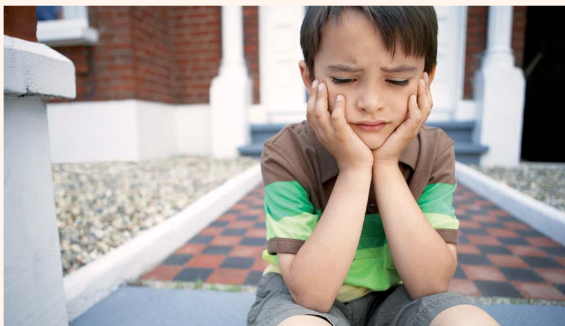
Despite more children in the UK suffering from dental problems, many have never been taken to a dentist.

Among its findings are that only a quarter of the children of the parents