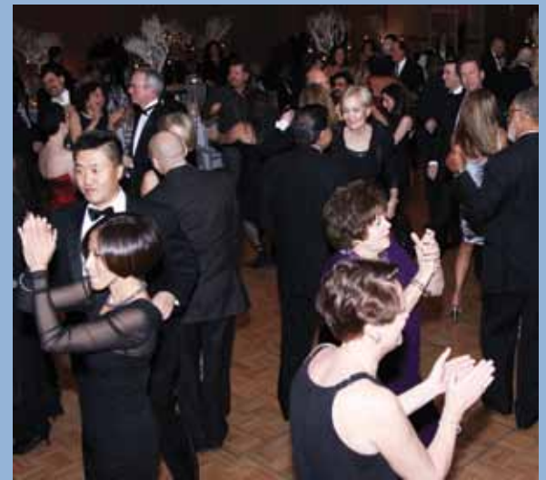
• The Greater New York Dental Meeting's annual Dinner Dance took place Saturday evening at the New York Marriot Marquis Hotel. The black-tie event featured cocktails, dinner and dancing with music provided by The Ultimate Entertainment.