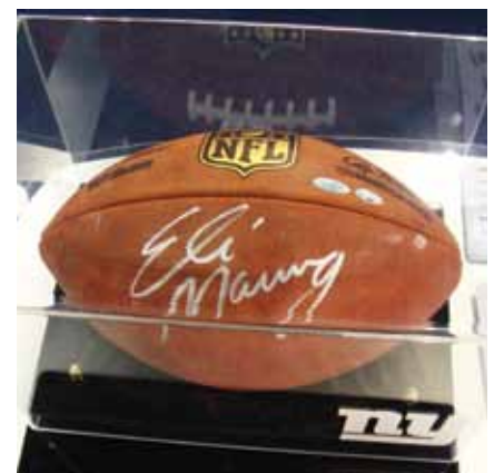
• Find out how you can have a football signed by Eli Manning at the Aseptico booth (No. 807).