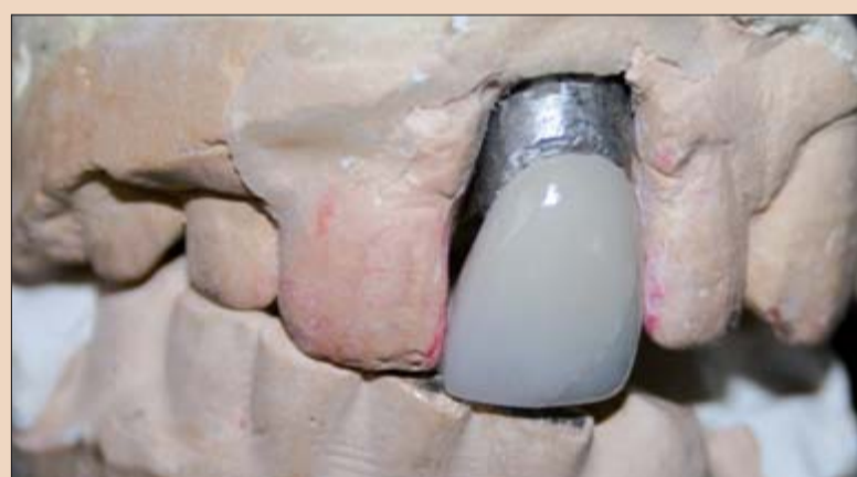
This dental crown made for Elvis Presley by his dentist was recently auctioned together with a dental impression of the "King of Rock and Roll" to a Canadian dentist. ▶ WORLD NEWS, page 5

Dental technician associations have criticised the regulations, which they fear could put many dental workers out of business and reduce the opportunities for middle- and lower-income patients to receive dental treatment at all. The costs for dental procedures offered by a tukang gigi are usually four to five times lower than treatment by a regular dentist. DTI