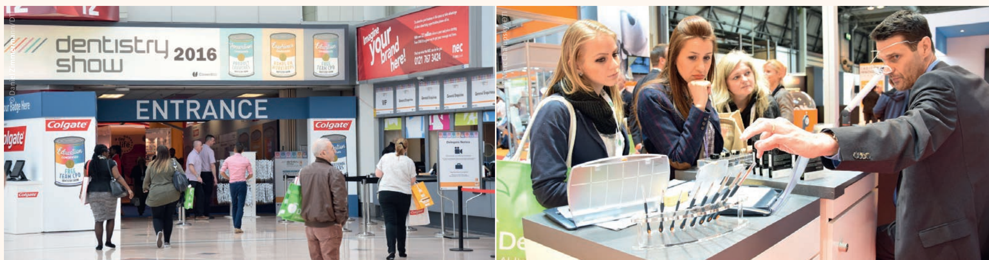
Left: Thousands of professionals attended the show in 2016 again. Right: Product presentations.