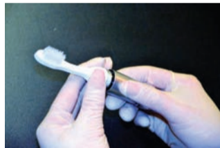
Fig. 3b: Unscrew the toothbrush and remove it from the dispenser.