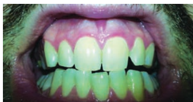
Fig. 9: Check after 21 days.