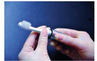
Fig. 3d: Screw the toothbrush again.