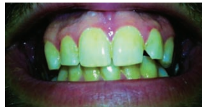
Fig. 2: 30-year-old male patient with discolouration on the central and lateral teeth; shade A3 of VITA shade guide.