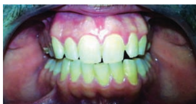
Fig. 10: Check after 28 days.