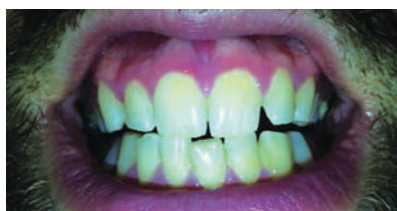
Fig. 8: Check after 16 days