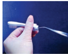
Fig. 3c: Remove the seal from the base of the toothbrush with tweezers.