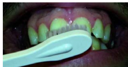
Fig. 3i: Brush again for further 30 seconds and rinse accurately.