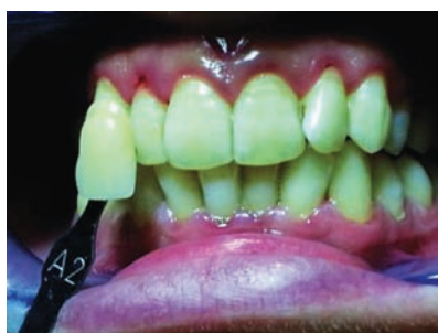
Fig. 13: Check after 10 days: the result corresponds to A2 of the VITA shade guide.