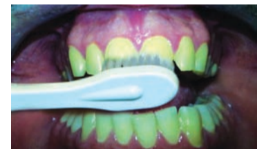
Fig. 3g: The patient must brush the teeth to be bleached for about 30 seconds with horizontal movements, avoiding contact with the gums as much as possible.