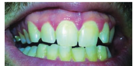
Fig. 4: Check after 4 days.