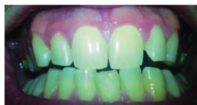
Fig. 6: Check after 10 days.