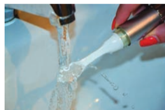
Fig. 3h: Rinse the bristles with running water.