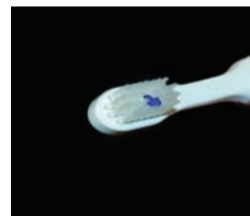
Fig. 3f: It is necessary to use a small lentil-sized dose of the gel.