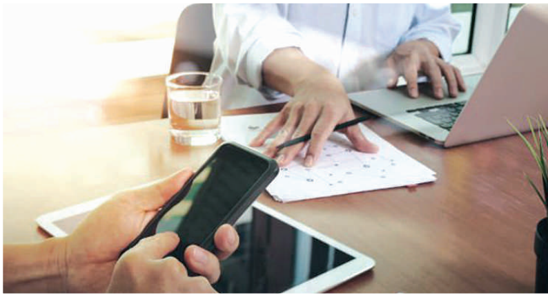
Teledentistry, which was first used by the US military to treat troops stationed far from dental specialists, could provide a means to improve access at low cost for people in need.