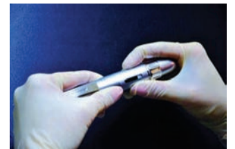
Fig. 3a: Unscrew and remove the cap of the toothbrush.