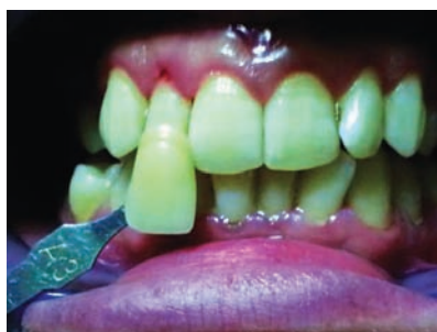
Fig. 12: A 25-year-old female patient, unsatisfied with a bleaching treatment with tray; initial colour of teeth was A3 of the VITA shade guide