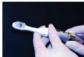
Fig. 3e: Rotate the ring anti-clockwise towards the direction 'UP' until the gel comes out from the hole among the bristles.