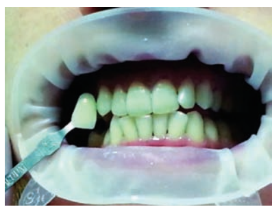
Fig. 14: Check after 21 days: she reached shade A1 of the VITA shade guide.

psychological aspects, due to the need of wearing the tray for hours or all night long[5] with interferences with normal interpersonal relationships both in private life and at work.