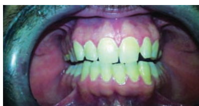
Fig. 11: Check after 35 days: the chromaticity at the end of the treatment corresponds to A1 of VITA shade guide.