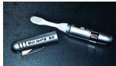
Fig. 1: Bleaching system ENA White 2.0: toothbrush with dispenser containing hydrogen peroxide bleaching gel with special activator XS 151, which increases its absorption rate exponentially.

Afterwards, the companies of the dental field worked hard to improve these procedures, such as designing pre-filled trays or changing the flavour of the gel. The method is substantially the same, only the percentage of hydrogen peroxide (also available as carbamide peroxide) may vary from 10 % to 30 %.[6,7] This influenced the contact period, which is at least from a couple of hours a day (for percentages that are only allowed for cosmetic bleaching) to all night long. All of them start from a single assumption: the bleaching action of peroxide needs a variable contact period to penetrate through the enamel prisms and the dentinal tubules, releasing active oxygen and allowing the free radicals to attack the chromophore particles and reach the