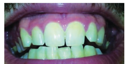
Fig. 7: Check after 12 days.