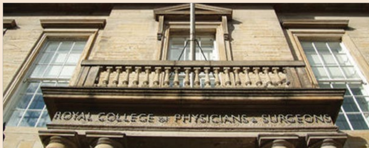
The Royal College of Physicians and Surgeons of Glasgow