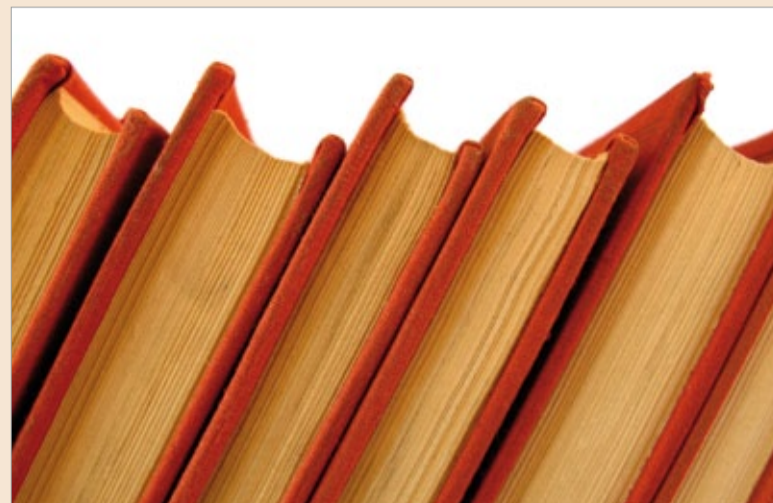
The archive will provide an essential record of the evolution of the dental profession

The project will comprise a series of witness seminars and individual oral history interviews, encompassing the full breadth of dentistry in the UK. DT