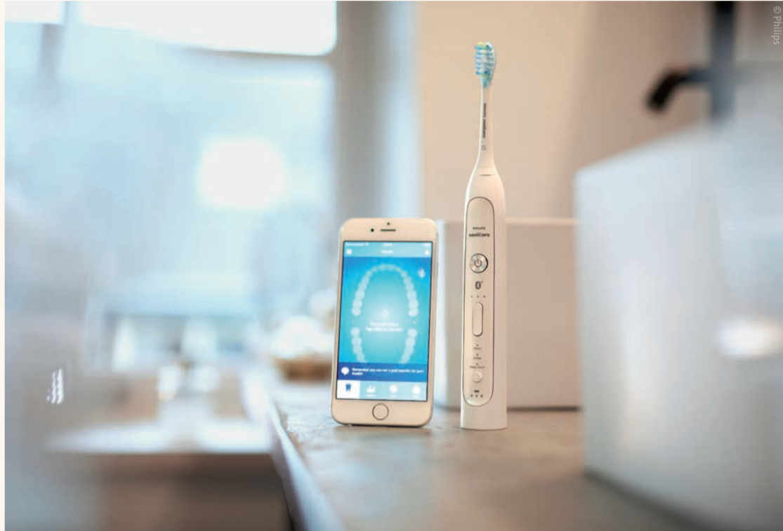
After first being launched in the US in July 2016, the new Philips Sonicare FlexCare Platinum Connected is now available in the UK.

The connected toothbrush synchronises with the Philips Sonicare app via Bluetooth to track brushing habits in real time. A number of sensors track and analyse the user's brushing routine while a personalised 3-D mouth map highlights trouble spots in order to coach the patient on his or her brushing technique. Loca-