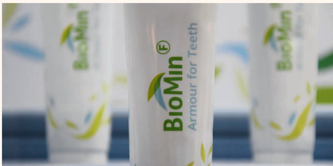
Toothpaste with bioactive glass has been available on the market since May this year.

"Research in the US suggests this will potentially prolong the life of fillings and slow secondary tooth decay because the depth of