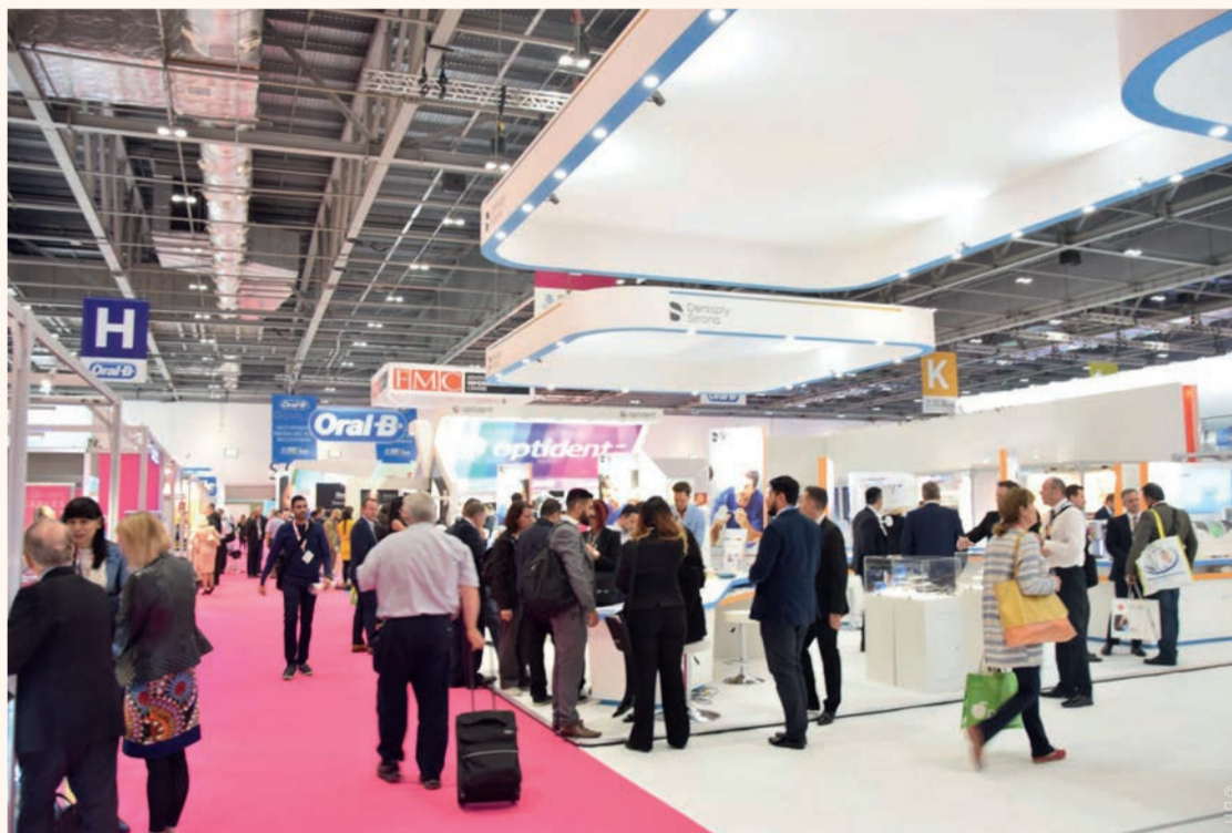
Up to 350 dealers and manufacturers presented their latest products and services in London.

This year's edition, which took place from 6 to 8 October at the ExCel, saw plenty of new products and services for dental professionals on display. Among the many newcomers to London was Dental Tribune International (DTI), which exhibited its extensive portfolio of publications and events at Booth N76. Visitors were invited to