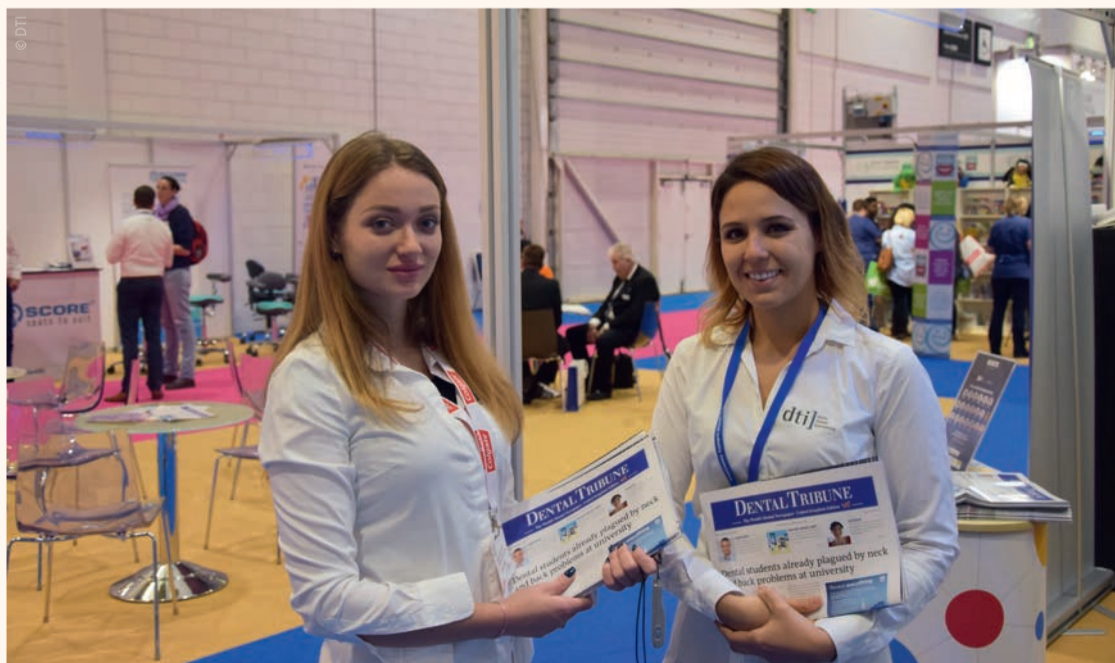
Dental Tribune presented for the first time at the Showcase.

Henry Schein was extending its recently launched loyalty scheme at the Showcase. Aimed at dental professionals who direct more than 80 per cent of their consumables spend to the company, the new REWARDS Platinum will offer a number of additional benefits, including double points on all purchases, 10 per cent discount on contract cover and annual service, as well as a zero charge on small orders.