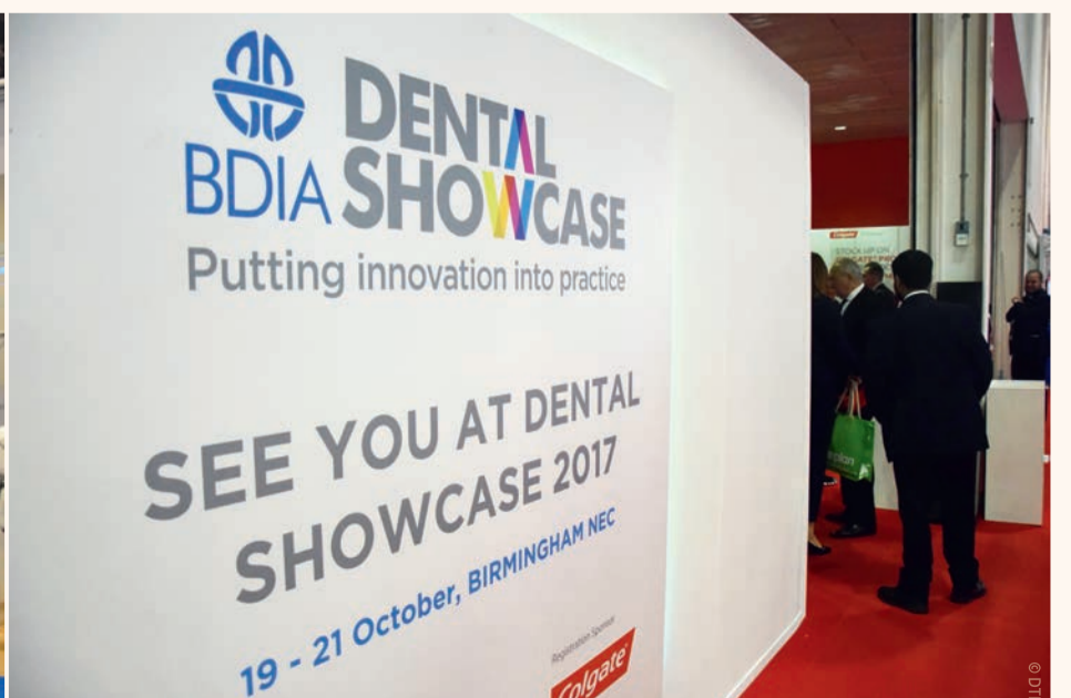
Announcement for BDIA Dental Showcase 2017