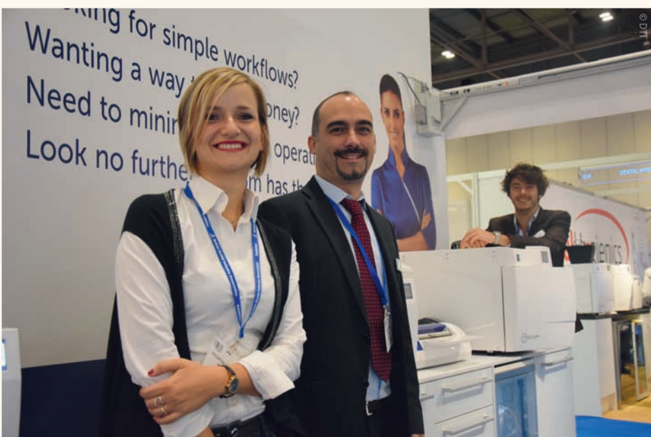
Italian manufacturer Mocom presented at BDIA for the first time.

try is in good health with practices and practitioners happy to apply many of the technological advances they have discovered at BDIA Dental Showcase 2016, the BDIA said.