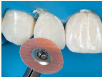
Fig. 7. To begin the contouring and polishing process, the proper length was first established with a Sof-Lex™ XT Contouring Disc. Second, an incisal-facial line angle was formed. Third, the mesio-facial line angle, as well as the incisal, facial and palatal embrasures were defined. Once contoured, the surface characterization of the adjacent teeth was copied onto the restoration using a fine diamond. In my experience, a speed of about 5,000 RPM using the diamond is ideal to create microanatomy.