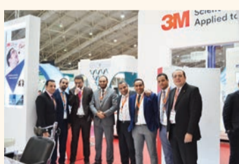
3M Oral Care at SDS

And with the Efficient Restorative Procedure solution 3M helps to simplify posterior restorations, one of the most common and complicated procedures. By using four 3M innovative technologies together (Filtek™ Bulk Fill Posterior restorative, Single Bond Universal adhesive, Elipar DeepCure curing light and Sof-Lex™ Diamond Polishing System) dentists can now move through a posterior restoration with speed and simplicity. Essential to this simpli-