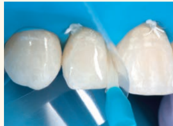
Fig. 4. To prevent contact of the adhesive with the adjacent tooth, another mylar strip was placed and adhesive was applied. The manufacturer's instructions for use states that you should rub in for 20 seconds, use a gentle stream of air for about 5 seconds, and light cure 10 seconds. My preference is to rub for 30 seconds, dry for 30 seconds and light cure for 10 seconds.