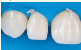
Fig. 2. Isolation with a rubber dam pushed the gingival apically to provide accessibility to the cervical area and allowed me to create proper anatomical contour and emergence profile.