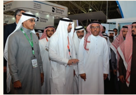
Three days of exhibition & conference