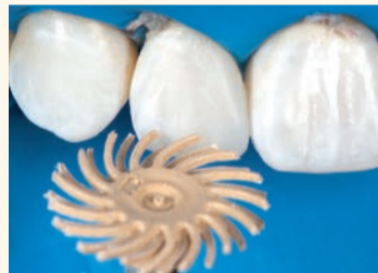
Fig. 8. Next, I utilized the Sof-Lex™ Diamond Polishing System, which consisted of two steps. First, a beige pre-polishing spiral smoothed and removed scratches in the restoration to prepare the surface for high-gloss polishing.