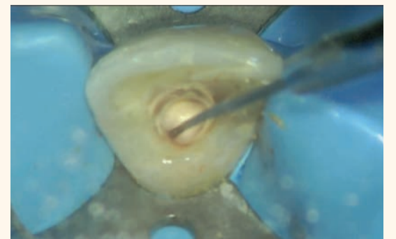
Figs. 1 & 2: Ultrasonic activation with a passive file (Fig. 1) and an active file (Fig. 2).

chanical activation of endodontic irrigants, and in particular NaOCl. Multiple agitation techniques and systems for irrigants have been used over time, 16 demonstrating more or less positive results. 7