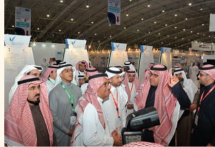
Over 6,000 participants attended