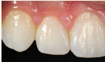
Fig. 11. The patient returned one week later for a final post-operative appointment. She was still very satisfied with the final restoration.