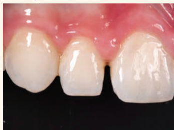
Fig. 1. The patient presented with a small anterior diastema.