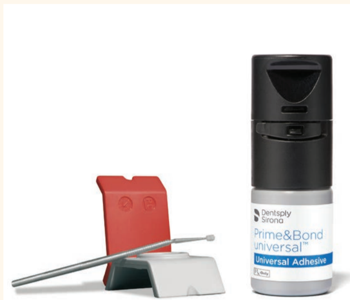
Partner glass ceramics can now also be processed in the CEREC SpeedFire with IPS e.max CAD (Ivoclar Vivadent) and Suprinity PC (VITA Zahnfabrik).

The patented Active-Guard Technology balances hydrophobic and hydrophilic features and helps to achieve an optimized surface ten-