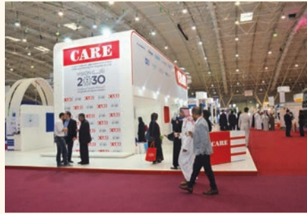
CARE was amongst the leading sponsors

CAPPmea – Dental Tribune MEA once again attended as close partner to the Saudi Dental Society for a 12th consecutive year. The event continues to prove year on year to be the leading scientific conference and exhibition in the Kingdom attracting world-class keynote speakers discussing the latest hot topics in dentistry. DTI