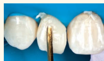
Fig. 6. This increment was then spread and feathered towards the middle of the tooth to improve blending. After this, I started contouring and polishing. The second increment was placed to fill the palatal aspect of the diastema with the help of a mylar strip. This completely closed the diastema.