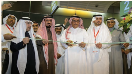
The opening ceremony