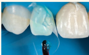
Fig. 3. A mylar strip was used to protect the adjacent tooth from etching. The mesial proximal, facial and lingual areas were etched. I prefer to use a selective etch enamel technique with Single Bond Universal Adhesive from 3M to increase the bond strength.