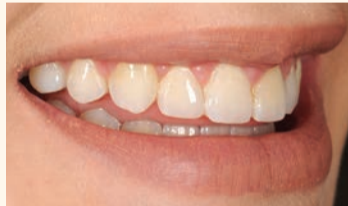
Fig. 10. Upon finishing the restoration, the patient was very satisfied by the ideal contour, surface smoothness and life-like luster.