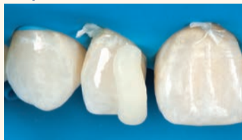
Fig. 5. Filtek Z350XT Universal Restorative shade XWE was placed in two increments and each increment light cured for 20 seconds. The first increment was placed over the facial aspect of tooth #7