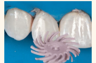
Fig. 9. Second, a pink diamond polishing spiral then imparted a smooth, high-gloss polish (Fig. 9). These spirals easily adapted to all surfaces. Finally, the proximal surface was polished with finishing strips.