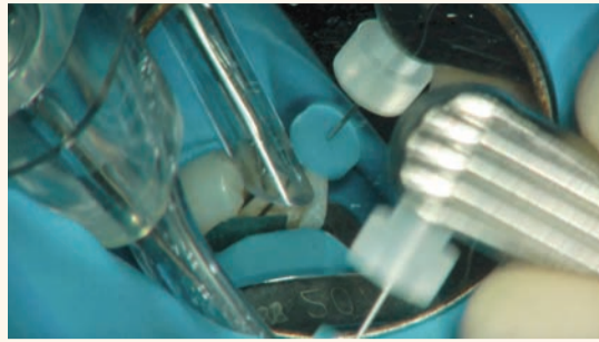
Fig. 3: Apical negative-pressure irrigation system used to enhance debris removal.