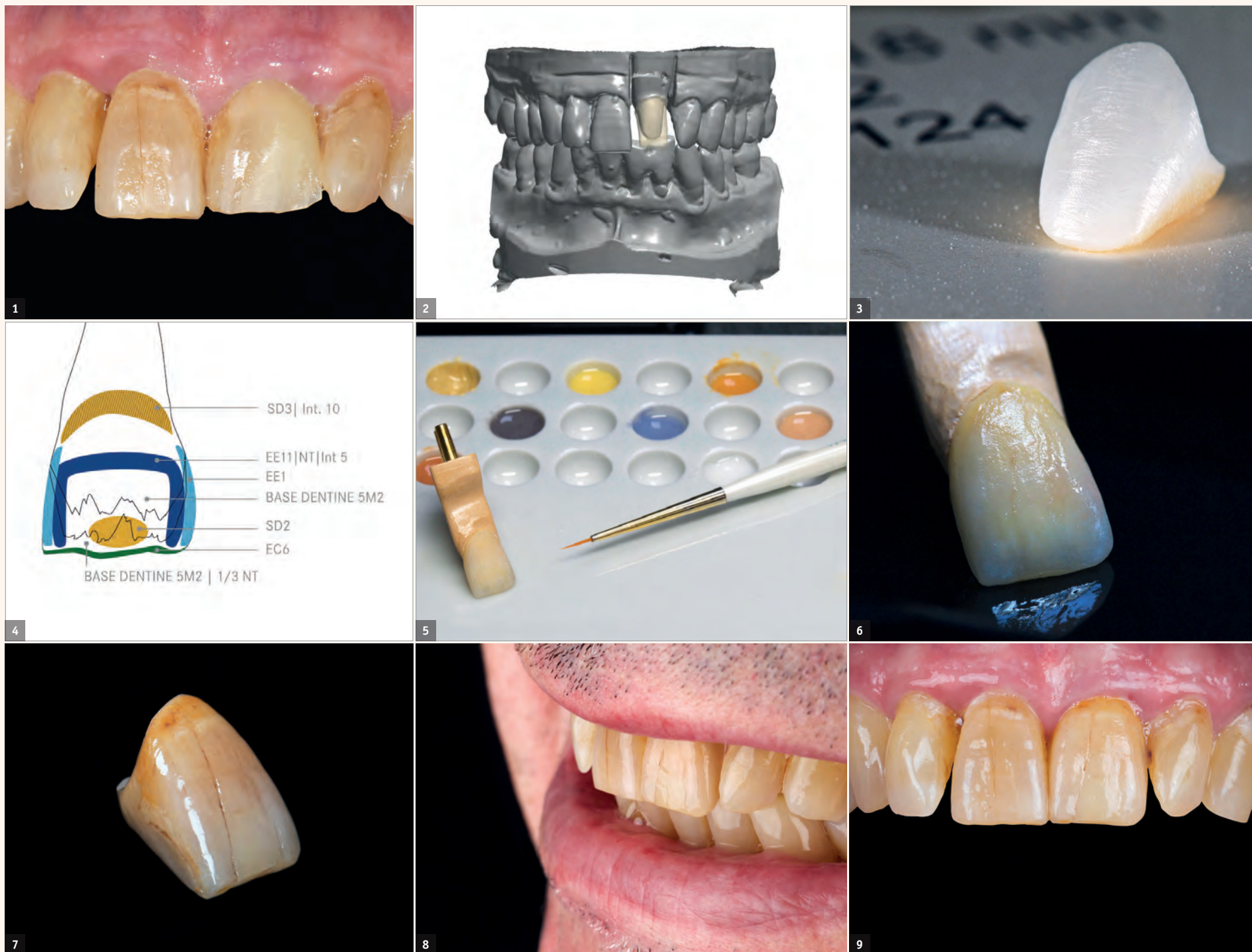
Fig. 1: Initial situation: Composite restoration of tooth #21 after distal transverse fracture of the tooth crown.— Fig. 2: After matching the wax-up with the master model, the functional crown was designed.— Fig. 3: The crown framework, prepared for veneering.— Fig. 4: After determining the basic tooth shade of 5M2 with the VITA Toothguide 3D-MASTER (VITA Zahnfabrik), the layering scheme was sketched.— Fig. 5: After a dentine firing, VITA INTERNO can be used for a second time to give depth with individual shade nuances.— Fig. 6: The VITA INTERNO stains allow for a multifaceted and age-appropriate reproduction of the natural teeth.— Fig. 7: The patient was very satisfied with the final aesthetic result.— Fig. 8: The shading and lighting of the restoration fitted in perfectly with the overall picture.— Fig. 9: The final full-ceramic crown had an age-appropriate morphology, surface texture and shading.

Creating natural effects with VITA VM materials