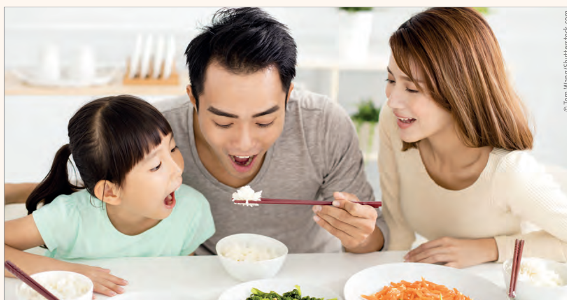
Food leaves permanent traces on teeth. A team of international researchers has now examined these marks—or microwear.

The researchers observed that, at every level of pressure, scratching led to more damage than indentation, but both types of stress resulted in three different kinds of damage. Plucking occurred