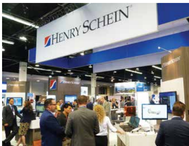
• The Henry Schein booth, No. 1362, has a wide variety of in-booth presentations and demonstrations you won't want to miss.