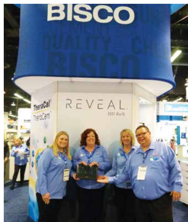
• The team at Bisco stands ready to 'Reveal' its new light-cured bulk fill restorative composite at booth No. 400.