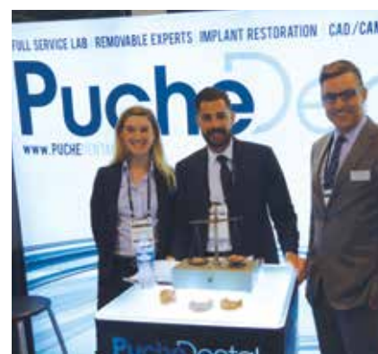
• Be sure to see the Puche Dental team at the booth, No. 590, where you can also check out Solvay's Ultaire AKP.