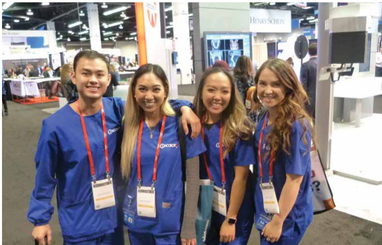
• Concord Career College, Garden Grove, students in the dental assistant program enjoy checking out the hundreds of CDA exhibit hall booths on Thursday.