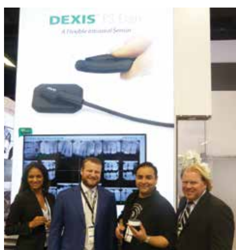
• Be sure to ask about the new DEXVoice hands-free option at Dexis, booth No. 1535.