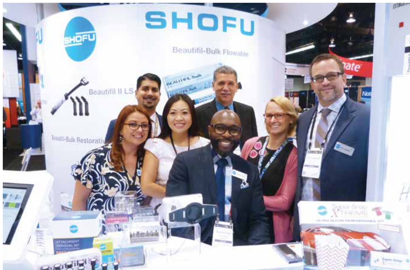
• Be sure to visit the team at Shofu Dental, No. 1128, who stand ready to answer all your questions.