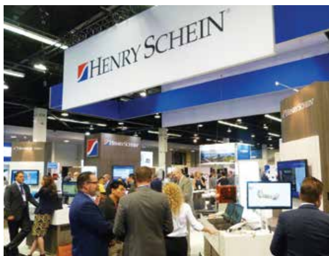
• The Henry Schein booth, No. 1362, has a wide variety of in-booth presentations and demonstrations you won't want to miss.