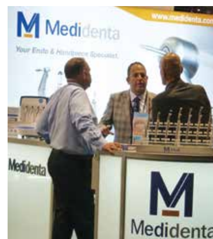
• Stop by the Medidenta booth, No. 1733, to ask about CDC bundles, free offers and big discounts on burs.