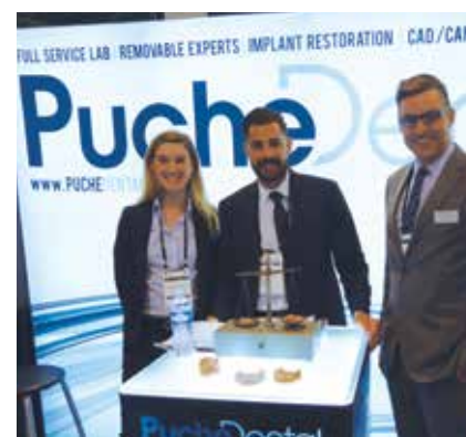
• Be sure to see the Puche Dental team at the booth, No. 590, where you can also check out Solvay's Ultaire AKP.