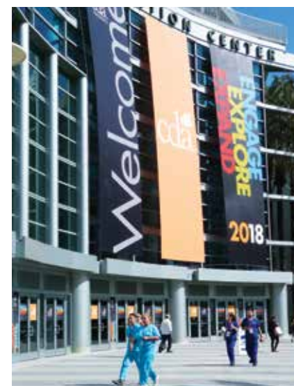
• Attendees stream into the first day of the CDA annual session in Anaheim, Calif.