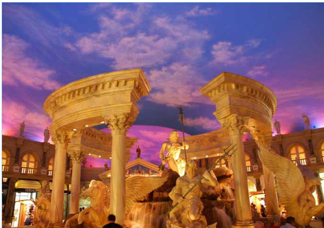
The American Association of Orthodontists will host its 2014 Winter Conference at Caesars Palace in Las Vegas.

The team aspect of the event is just the beginning, according to organizers, as there will be a comprehensive set of presentations from recognized clinical experts, covering topics ranging from new treatments in adult esthetics to sleep apnea to breakthrough orthodontic and restorative materials as well as computer-assisted diagnostics and treatment.