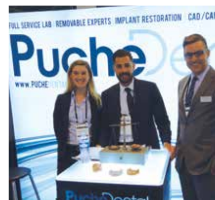
• Be sure to see the Puche Dental team at the booth, No. 590, where you can also check out Solvay's Uitraire AKP.