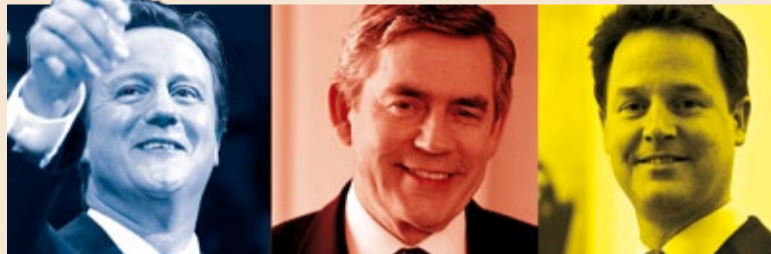
Any takers? Cameron, Brown & Clegg in leadership battle

Ministerial Health team decimated by lost seats, lack of clear outcome leaves both dentistry and country in limbo