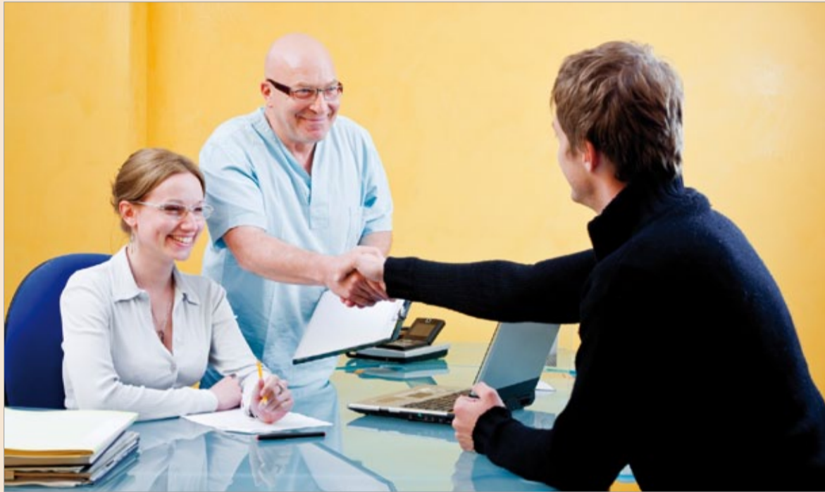
Keep patients coming back to your practice by taking time to get to know them

We all have been suffering and seen our neighbours suffering from the effects of the economic downturn, but what keeps your patients coming back to you for more treatment?