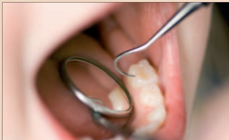
The figures show there was a 13 per cent rise in the incidence of hospital admissions relating to children's tooth decay in five years said the Conservatives.

However a spokesman for the Department of Health called the allegations 'misleading' and said: 'To claim we are doing nothing on preventative dentistry is simply wrong. All NHS dental practices now have access to evidence-based practical guidance on effective preventative treatments.' DI