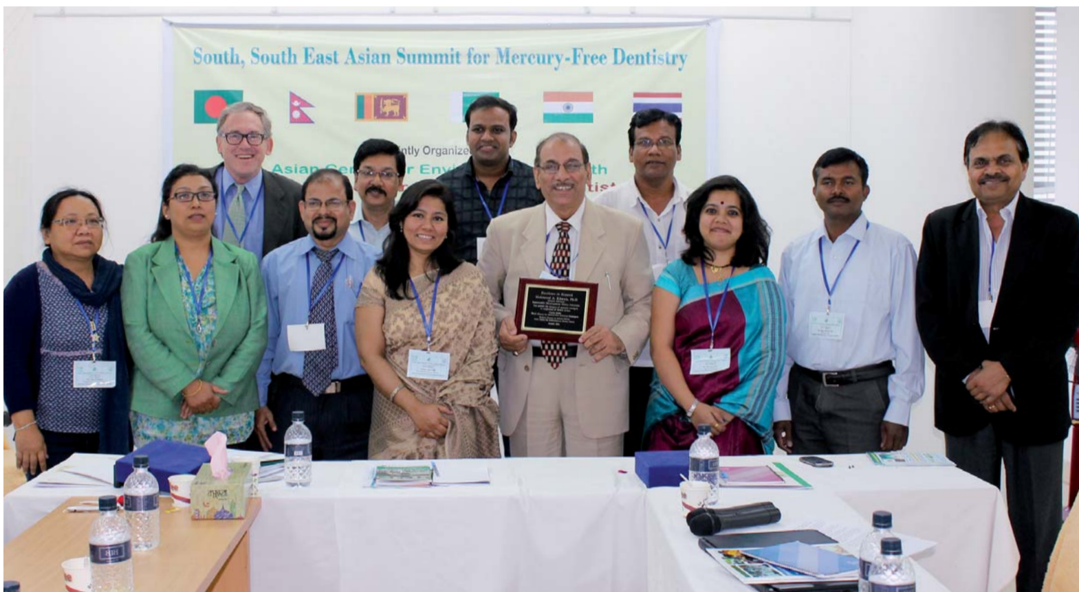
The declaration was formulated last November in Dhaka.

While the environmental effects of amalgam waste in Asia remain largely unknown, it is believed that the continent contributes significantly to the overall global burden. According to a 2013 report released by the United Nations Environment Programme, amalgam waste entering the solid waste stream amounts to 340 tons worldwide. Total emissions of mercury resulting from cremation of human remains were estimated at 3.6 tons. ◀◀