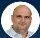
Antonis Chaniotis Greece