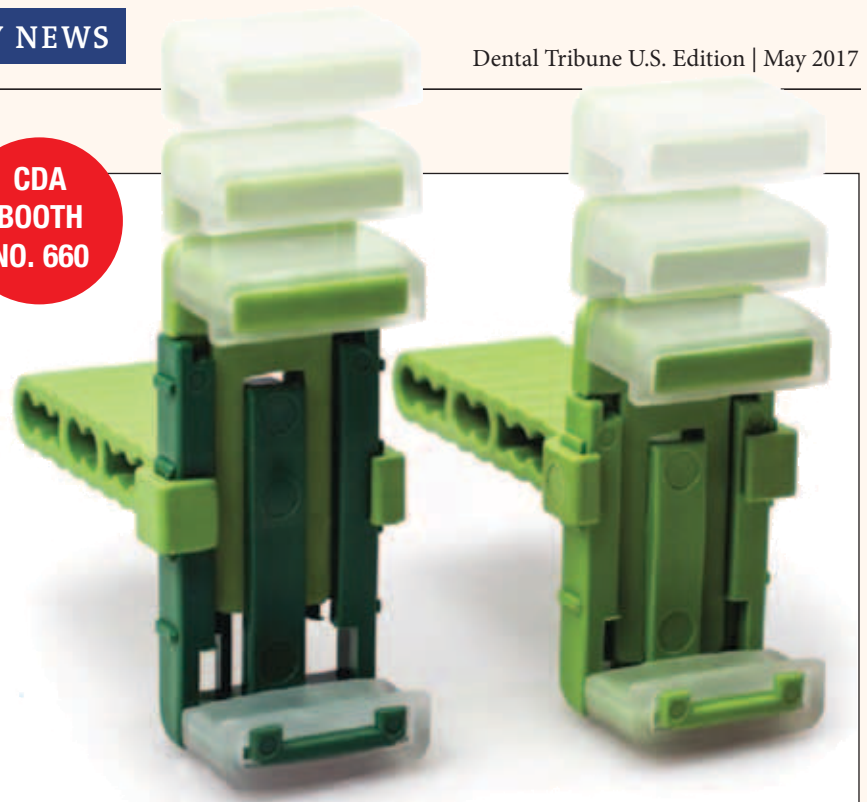
The Sensibles universal sensor positioner (large and medium sizes pictured) now feature unique locking bumpers that enable you to slide the bite block to any of several fixed positions.