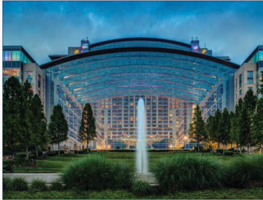
The Gaylord National Resort and Convention Center, host site of AAPD 2017, features a 19-story glass atrium and sweeping views of the Potomac River. The resort is near National Harbor's entertainment and shopping district and eight miles south of the nation's capital.