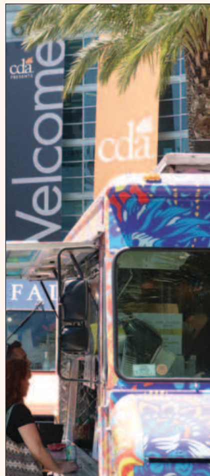
A bevy of food trucks, including this one in 2016, attracts big lunch crowds at the Anaheim Convention Center, host site of CDA Presents the Art and Science of Dentistry, which this year is from May 4–6.