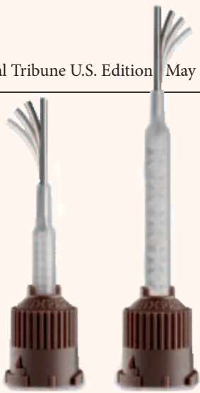
Colibri tips deliver precisely mixed material via a stainless-steel cannula that keeps a uniform inner diameter even if bending up to 180 degrees.