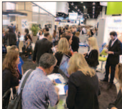
The exhibit floor at the 2016 CDA Presents.