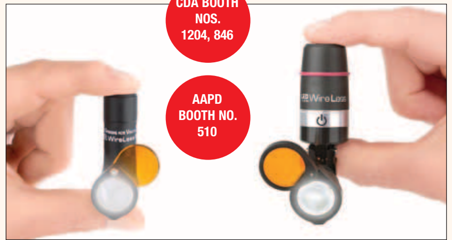
The new LED DayLite WireLess and the new LED DayLite WireLess Mini headlights can integrate with various platforms, including your existing loupes, safety eyewear, lightweight headbands and future loupes or eyewear purchases.

The LED DayLite WireLess is powered by a compact, rechargeable lithium-ion