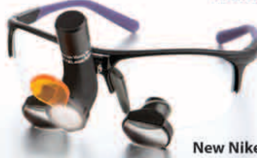
New Nike Run frame shown with LED DayLite® WireLess Mini

Totally WireLess Headlights — no wires, no battery pack