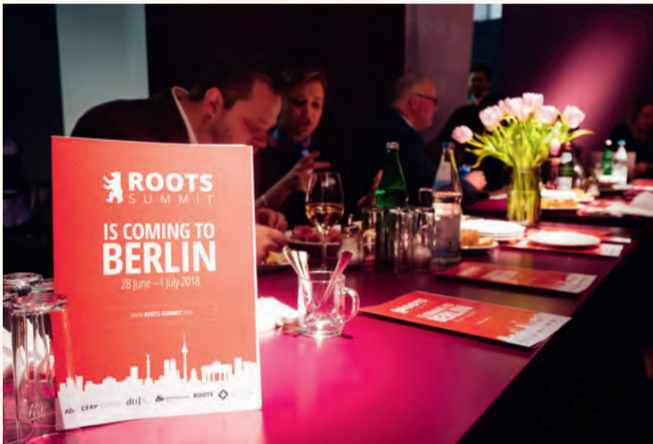
Following on the success of last year's event in Dubai in the UAE, the next edition of ROOTS SUMMIT will take place in Berlin in Germany from 28 June to 1 July 2018.