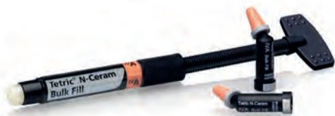
Tetric® N-Ceram Bulk Fill sculptable

* Compared with Tetric® N-Flow and Tetric® N-Ceram Data available on request.