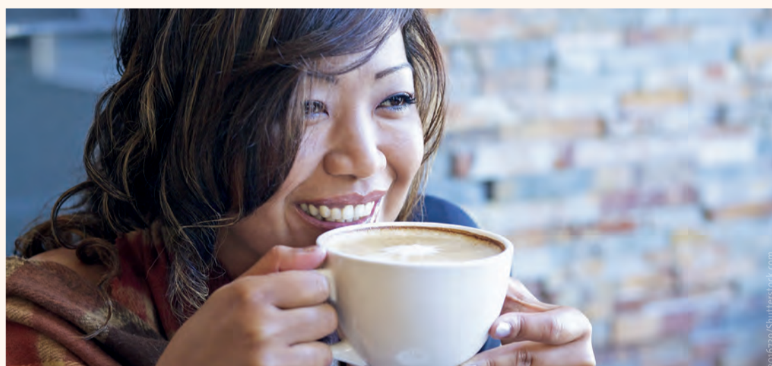
Coffee is one of the world's most popular beverages; however, it is known for its tooth staining properties. A study has now tested how various CAD/CAM materials reacted to immersion in coffee.

New CAD/CAM composite resin blocks are industrially polymerised under standardised parameters at high temperature and pressure to achieve optimum properties at the microstructural level and a high degree of conversion. As a result, material charac-