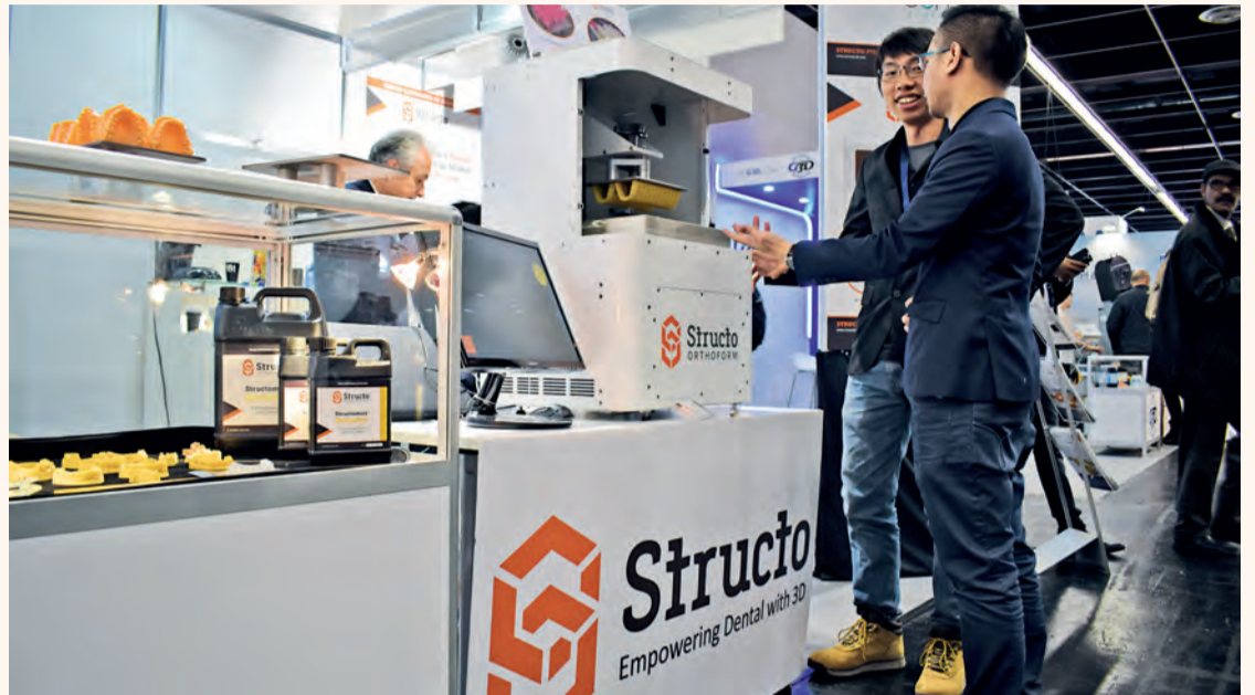
The Structo OrthoForm, the company's first dentistry-specific 3-D printer, was presented at this year's International Dental Show in Cologne in Germany.

Instead of relying on an external aligner manufacturer or a dental laboratory, FDC now has a clear aligner manufacturing line in its own facility. By managing the manufacturing process itself, FDC can now eliminate the bottlenecks of working with external manufacturers, for example the