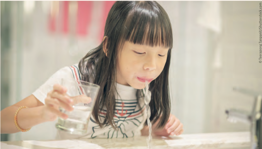
The majority of respondents surveyed incorrectly believed that rinsing one's mouth with water after brushing is important.