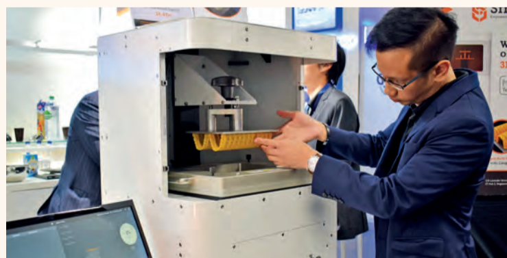
The Structo OrthoForm presented at the 2017 International Dental Show. The device is the first dentistry-specific 3-D printer tailored for orthodontic applications. ► BUSINESS Page 4