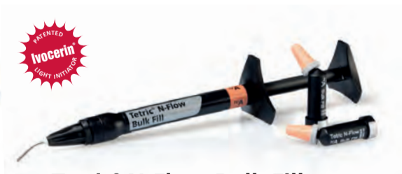
Tetric® N-Flow Bulk Fill flowable