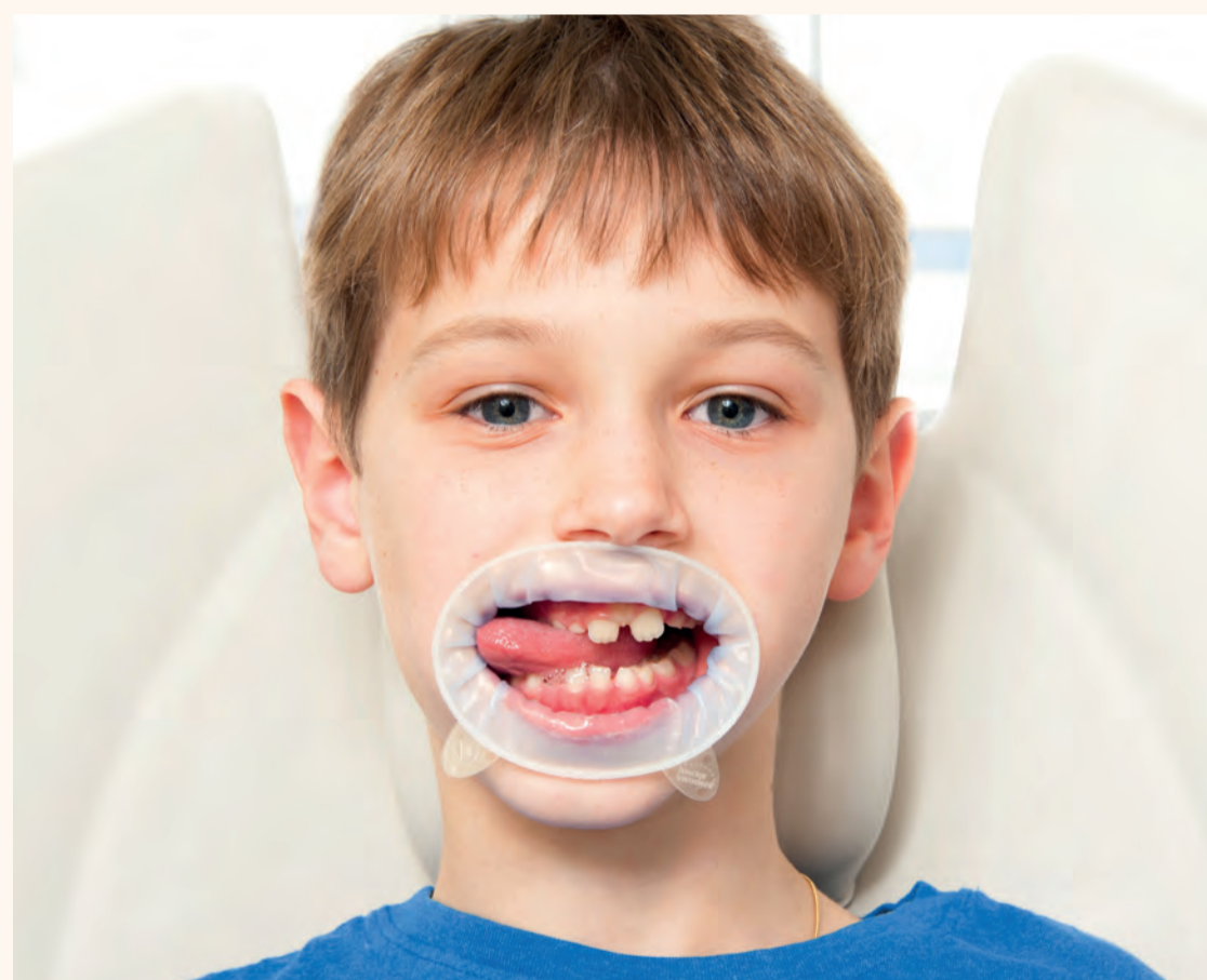
The oral device can be used for a wide range of applications, including intra-oral scanning, the placement of indirect restorations, orthodontic treatment and paediatric dentistry.

Yes. As I can concentrate more intensely on the actual treatment