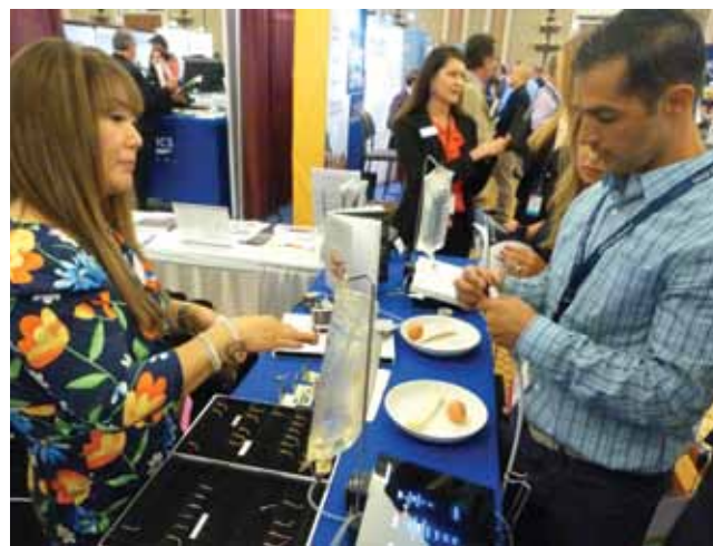
• An AAID attendee checks out Piezosurgery technology at booth No. 510.