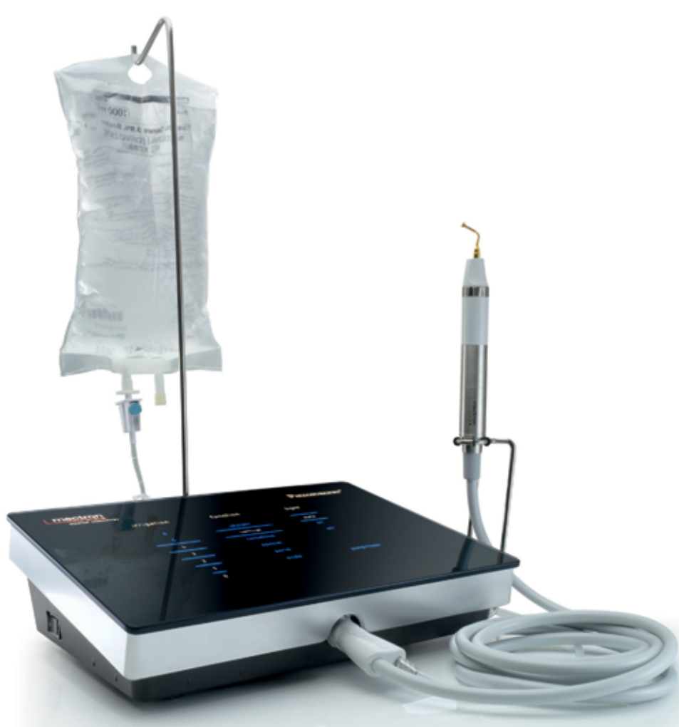
PIEZOSURGERY® touch Starting at $10,950

From the general practitioner to the specialist, PIEZOSURGERY® by Mectron has options for everyone.