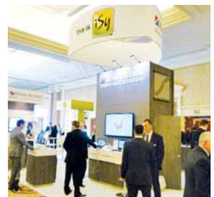
• Henry Schein Surgical, booth No. 401, can teach you how to keep dental implants 'iSy' (pronounced 'easy').