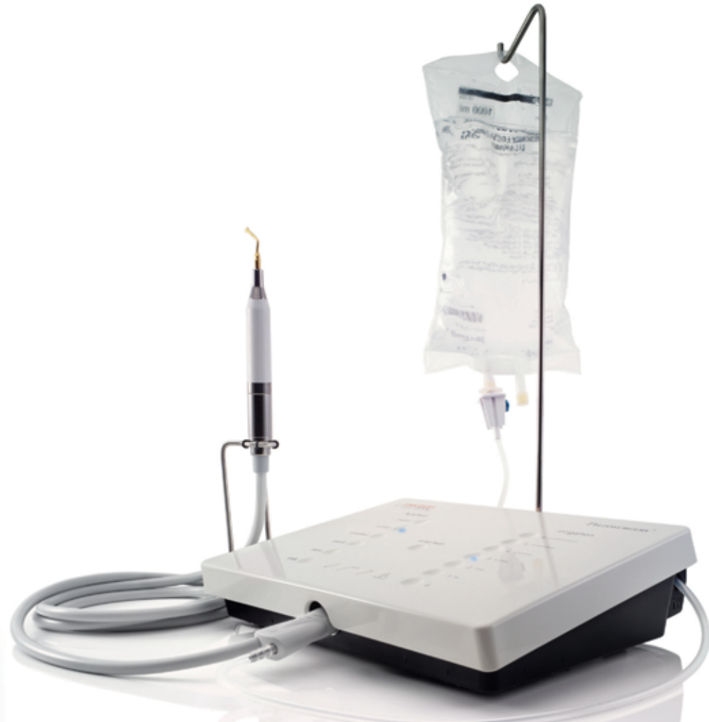
PIEZOSURGERY® GP Starting at $7,500

Which PIEZOSURGERY® by Mectron device is right for you?