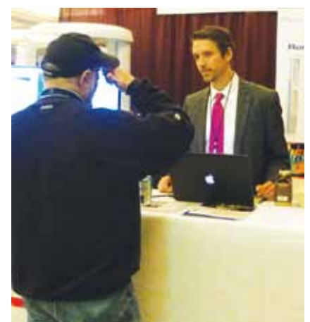
• Stop by the Planmeca booth, No. 203.