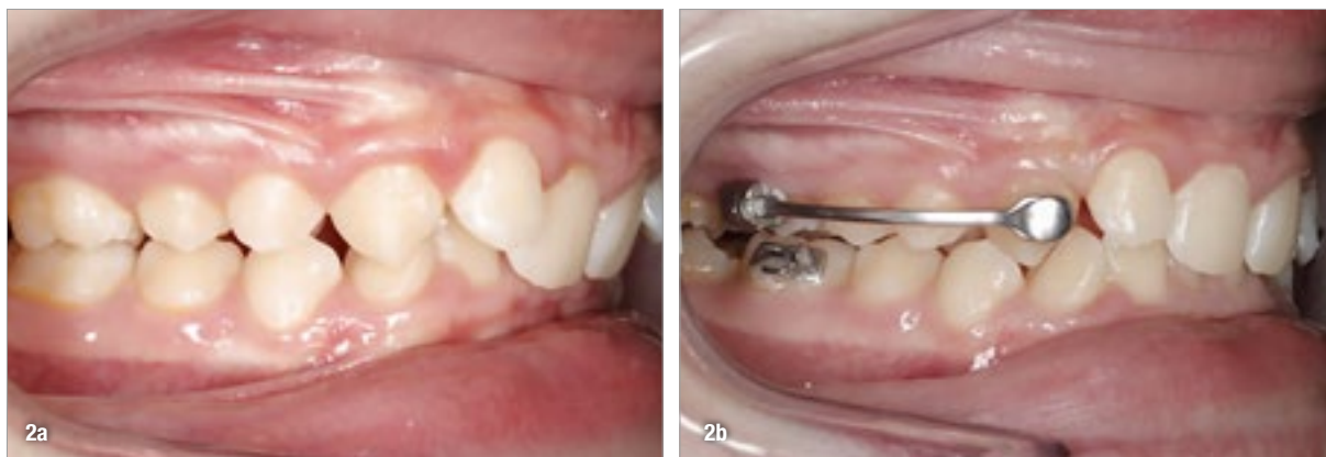
Figs. 2a & b: Case of a Class I occlusion accomplished in two months with the Carriere Motion Pro.

sagittal dimension by moving groups of teeth, generating a Class I occlusion before any comprehensive orthodontic treatment. In this manner, the molars, premolars and canines are brought into a Class I relationship where the maxillary and mandibular first molars exhibit adequate distal rotation and adequate uprighting, depending on whether the clinician is treating a Class II or Class III malocclusion. 5-7 This Class I occlusion is usually accom-