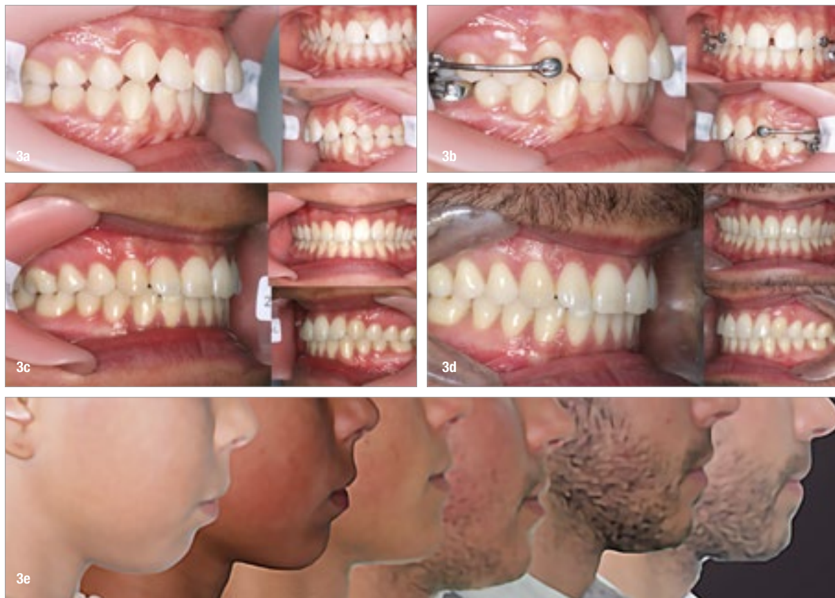
Figs. 3a-e: Case demonstrating the long-term stability of the Carriere Motion Appliance. Sixteen (16) years of follow-up of a Class II case.

Today, patients request solutions for their malocclusion that are both aesthetic and efficient. The new Carriere