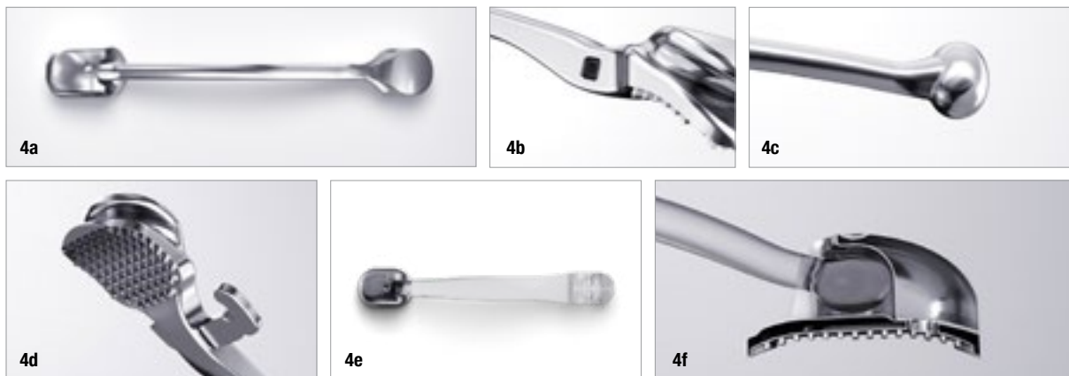
Figs. 4a–f: Various perspectives of the metal and clear Carriere Motion Pro.

Motion Pro is an appliance that uses design and biomimetics to substantially enhance the biomechanics of the original Carriere Motion Appliance, boosting the Sagittal First approach. Inspired by the shape and function of the temporomandibular joint, the new Carriere Motion Pro incorporates a totally new condyle shape hinge designed to produce ultra-low friction. This joint facilitates accurate distal rotation, precise uprighting and optimal molar torque simultaneously, achieving a Class I occlusion efficiently (Fig. 1). The knowledge of the last 20 years of using the original Carriere Motion Appliance has been employed in the redesign of the appliance to achieve next-level movement (Fig. 2).