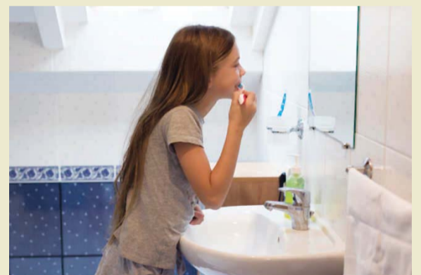
In a recent study, researchers in Germany have found, since a previous 2003-2006 report, the frequency of dental check-ups has increased.

BERLIN, GERMANY - In a new study, researchers from the Robert Koch Institut (RKI) have examined, among other subjects, the prevalence, determinants and trends of tooth brushing frequency and utilisation of dental check-ups in children and adolescents in Germany. The reports are based on