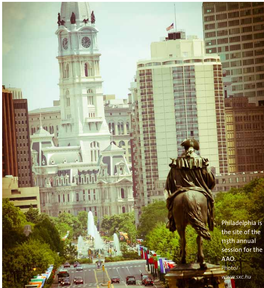
Philadelphia is the site of the 113th annual session for the AAO.