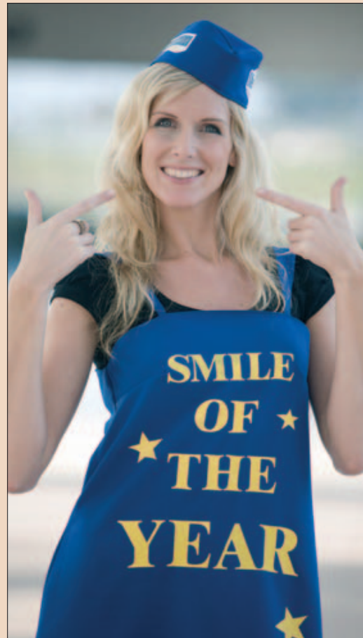
Schottlander has launched its new search for the 2009, Smile of the Year, award.