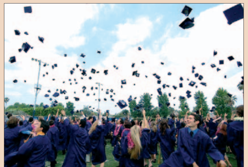
Smile-on means Top Class

In addition, Smile-on was open to enquiries about its Clinical Governance Progress Management course - which allows Primary Care Trusts to monitor