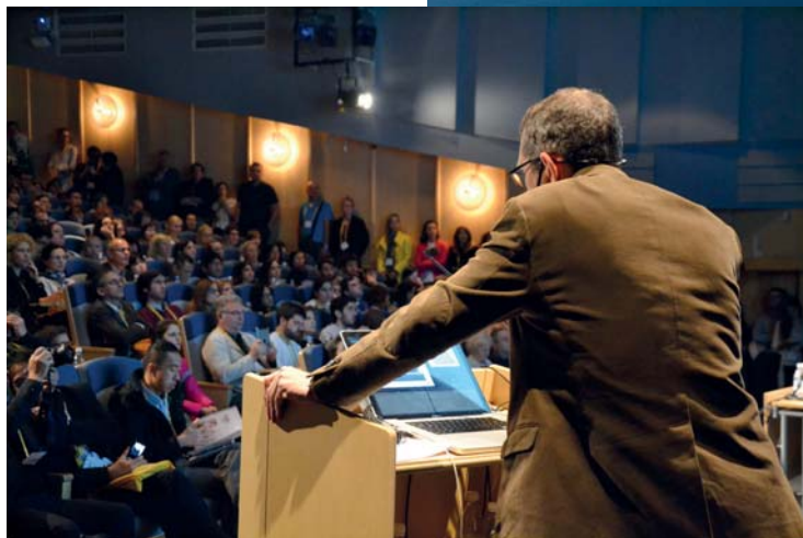
▲ Keynote presentation