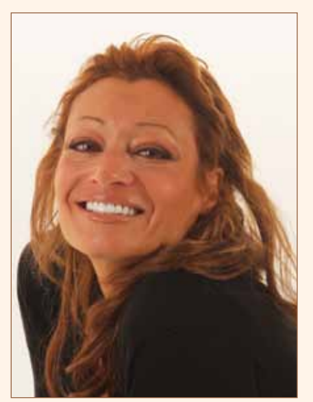
Botox and dermal fillers are the perfect complement to your esthetic dental practice.

Interestingly, these procedures become more popular in an uncertain economy because patients want to do something to look better that is more affordable than surgical esthetic options.